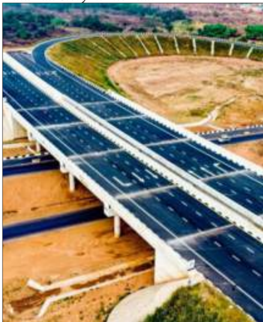
Ibadan Circular Road