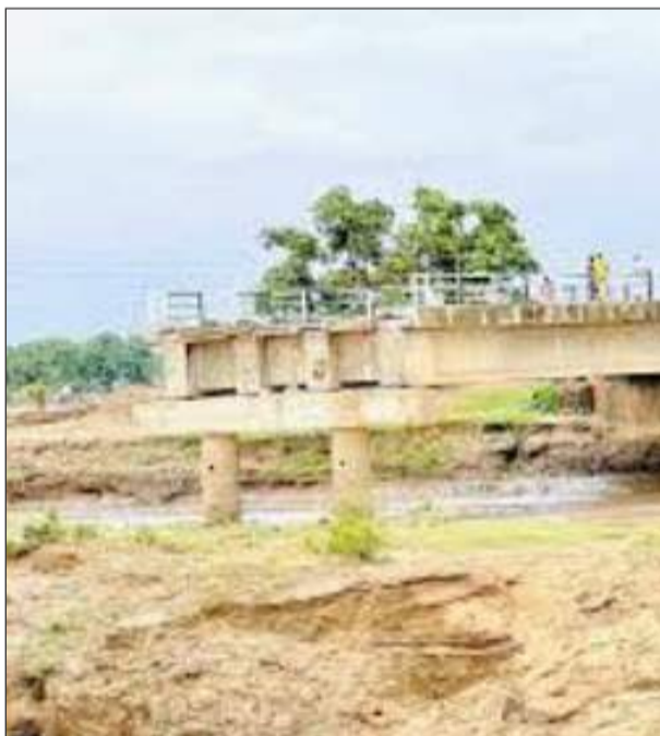
Unrepaired Taraba bridge

A year after heavy floods caused the collapse of the Namnai Bridge in the Gassol Local Government Council of Taraba State, the absence of both federal and Taraba State government intervention—and growing impatience with political inaction—has culminated in a grievous tragedy.