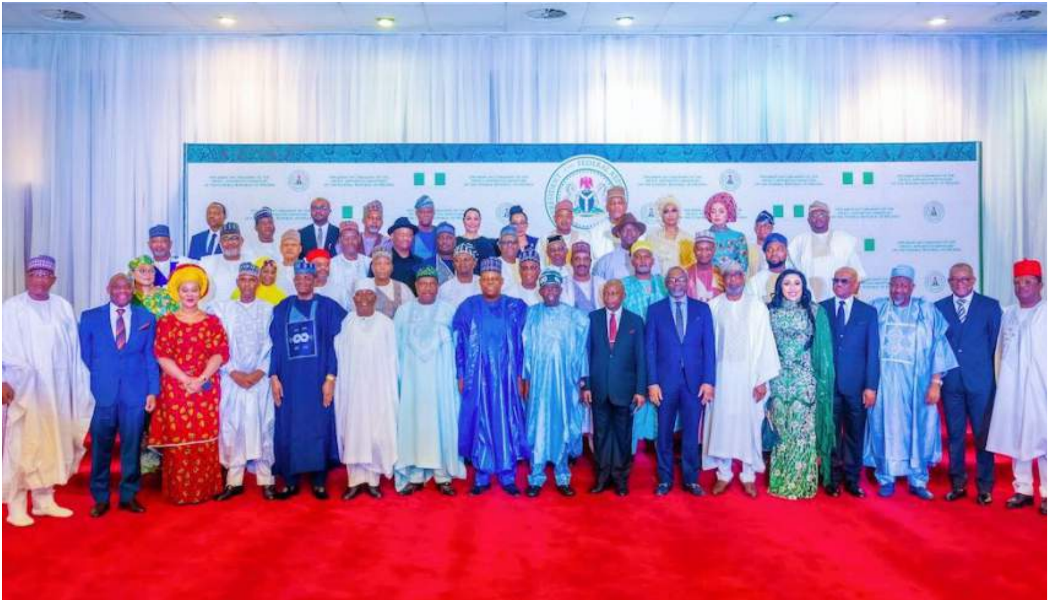
Tinubu and the Federal Ministers