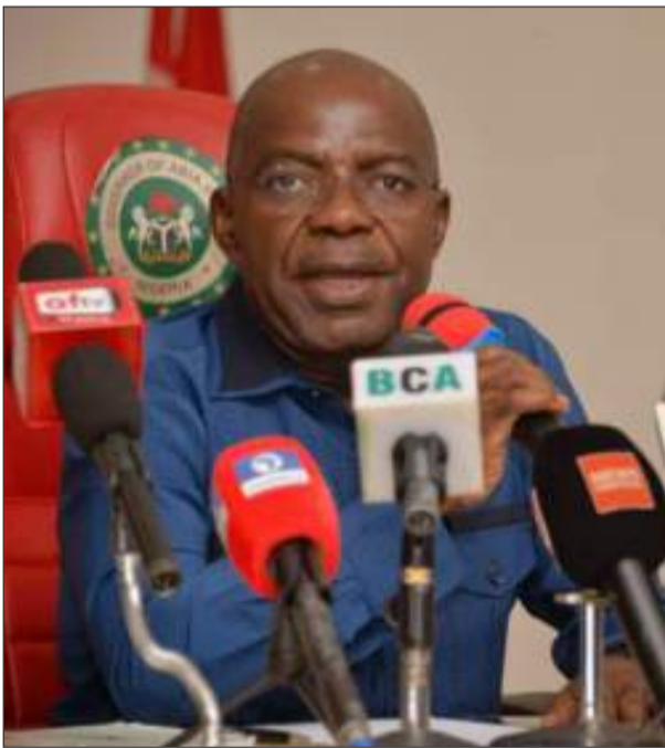
Barge on waterways

Abia State Governor Alex Otti, has stated that he is committed to the timely realisation of the proposed 10,000 barrel per day modular refinery project in the State.