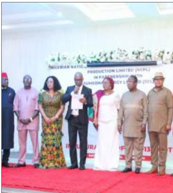
Sumedha Energy Limited

The Nigerian National Petroleum Company Exploration & Production Limited (NEPL) in partnership with Sumedha Energy Limited (SEL), officially inaugurated the Board of Trustees (BOT) for the OML-13 Host Communities Development Trust (HCDDT) in Akwa Ibom state.