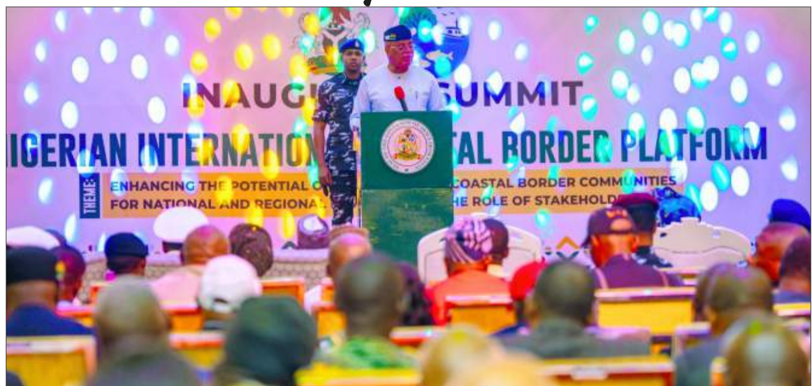
Nigeria International Coastal Border Platform

maritime safety and security to foster a culture of compliance with national and international laws, the forum recommended that the country take advantage of the African Integrated Border Governance Strategy and the African Continental Free Trade Zone to boost cross-border trade between coastal communities and neighbouring countries.