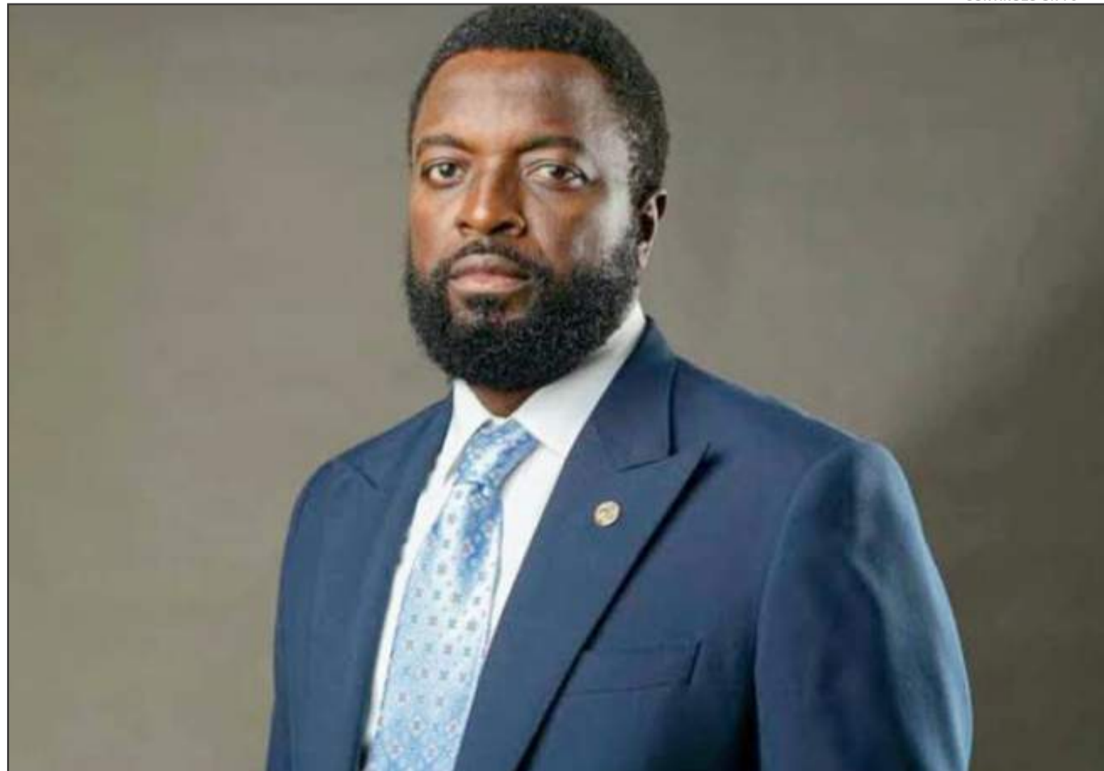
Commissioner of Transportation Lagos State, Oluwaseun Osiyemi