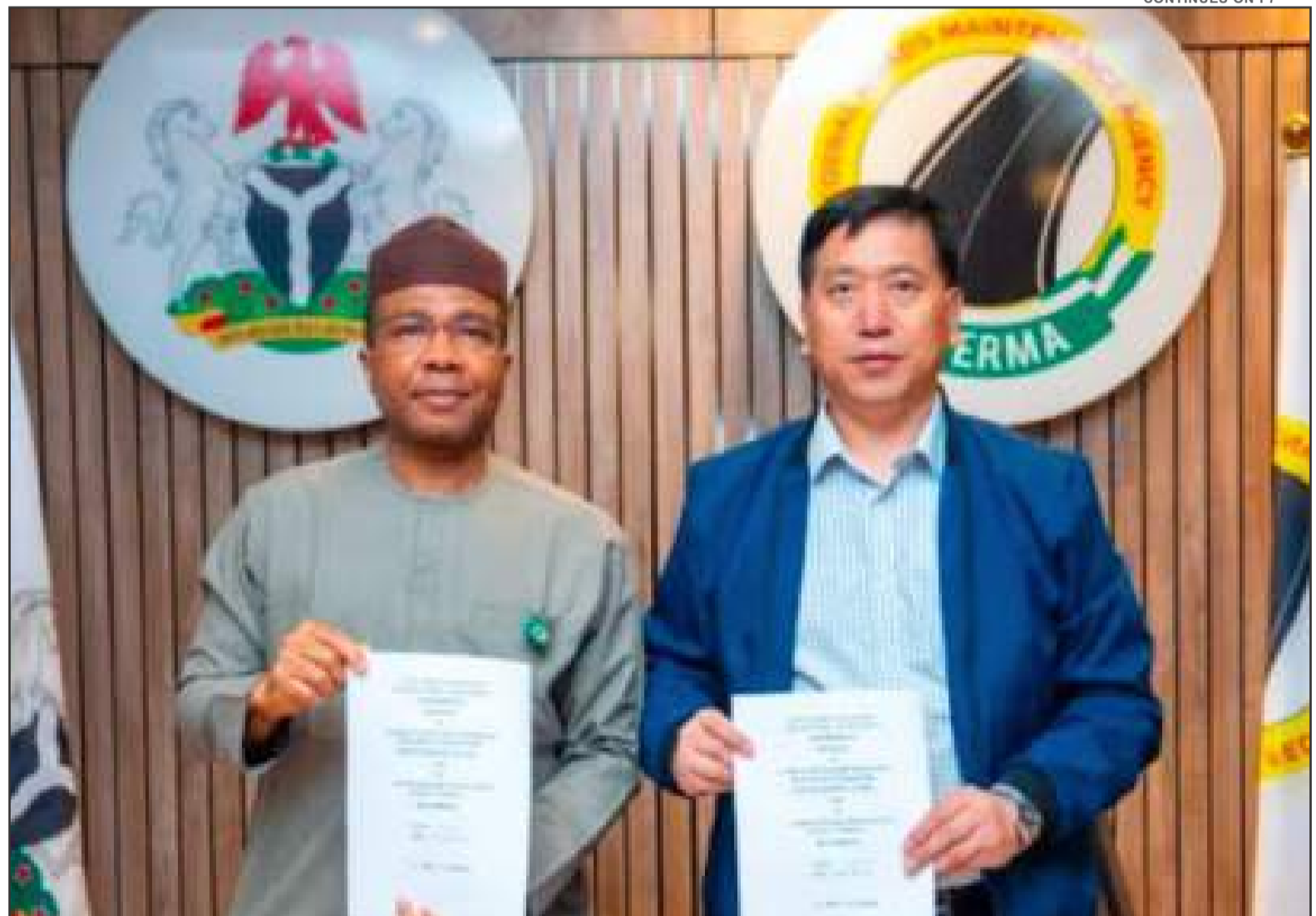
FERMA signs an agreement with GCPRC to boost Road Cooperation