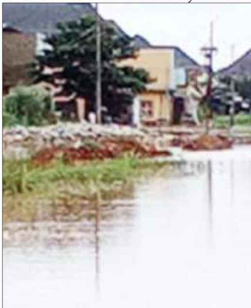
A flooded area