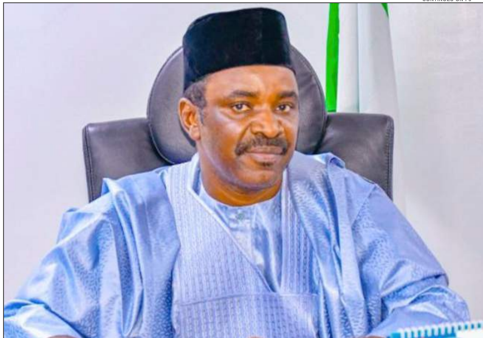
Minister of Transportation, Saidu Alkali