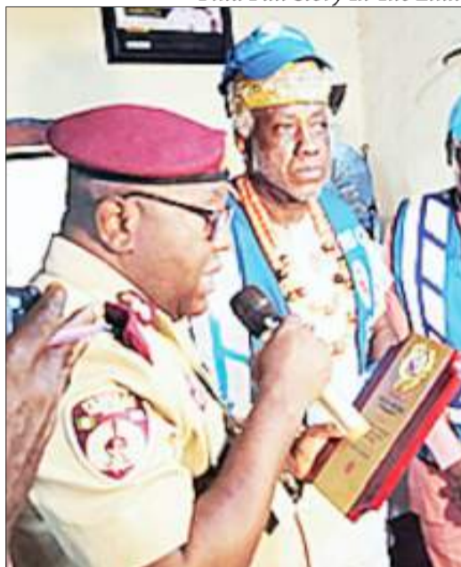
FRSC Conferring the award to the Monarch