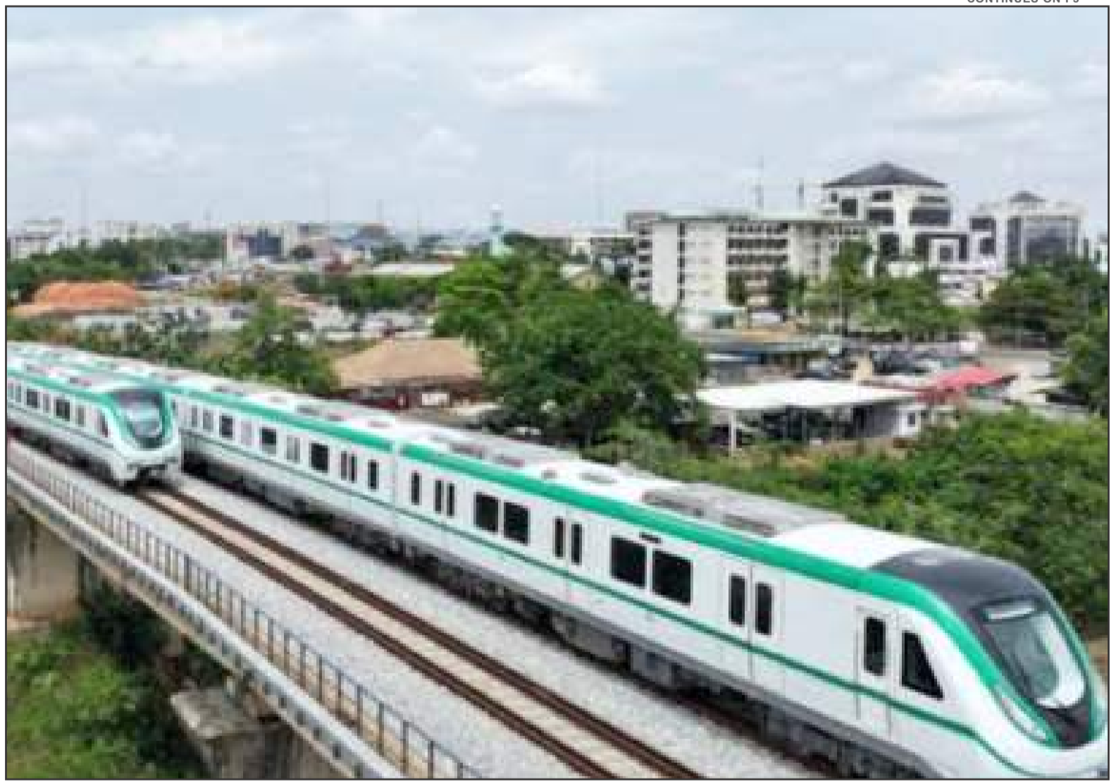
Abuja Rail Service

AGF Aviation Leases Two Aircraft To Cally Air P3