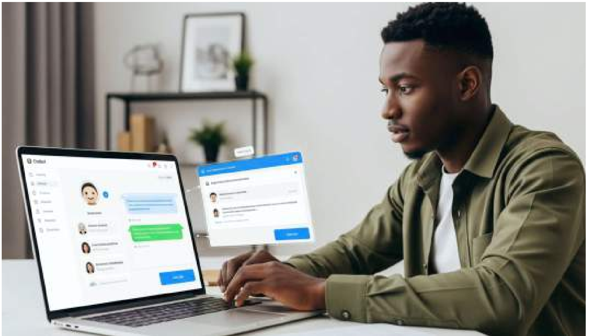
Social Media Messaging Chatbox