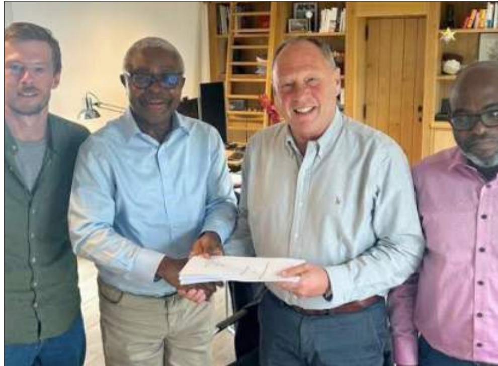
Traxport Railway Service

"Vecturis' wealth of experience in similar markets will enable us to leapfrog operational challenges and fast-track the delivery of modern, sustainable freight rail solutions for Nigeria," Ndu stated. "Together, we are not just moving goods — we are