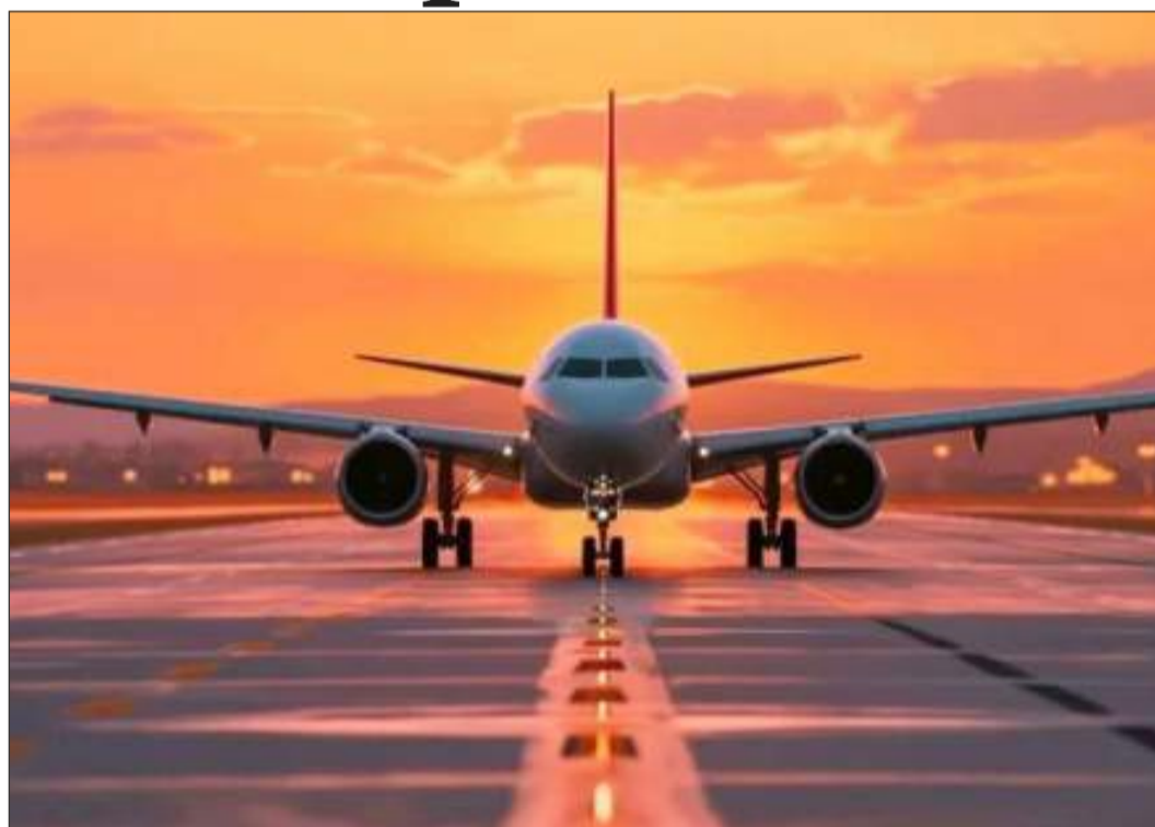
Airplane on runway

At the lower end of the table, states such as Benue (N38.54 million), Jigawa