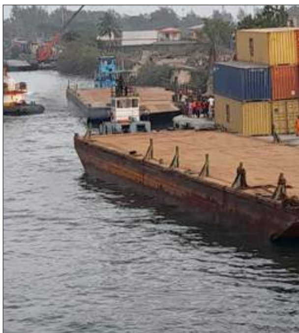
Barge on waterways

Maritime experts have raised fresh concerns over the unchecked spread of unregistered and poorly-constructed barges on Nigerian waterways, warning that the trend poses grave risks to maritime safety, port operations and the reputation of the country's shipping industry.