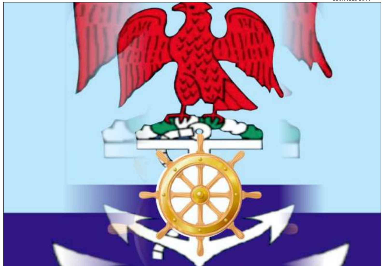
The Nigerian coastguard logo