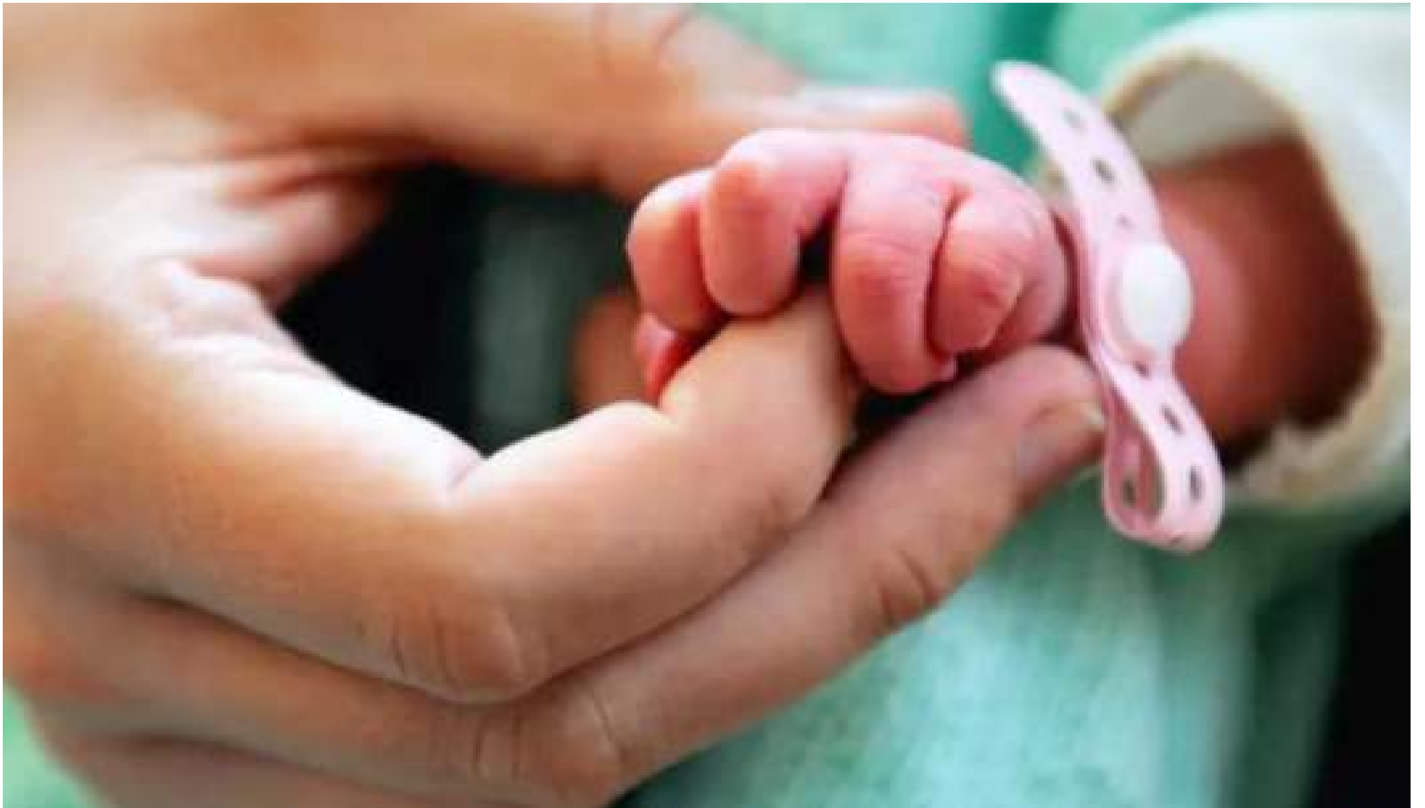
A father and his child