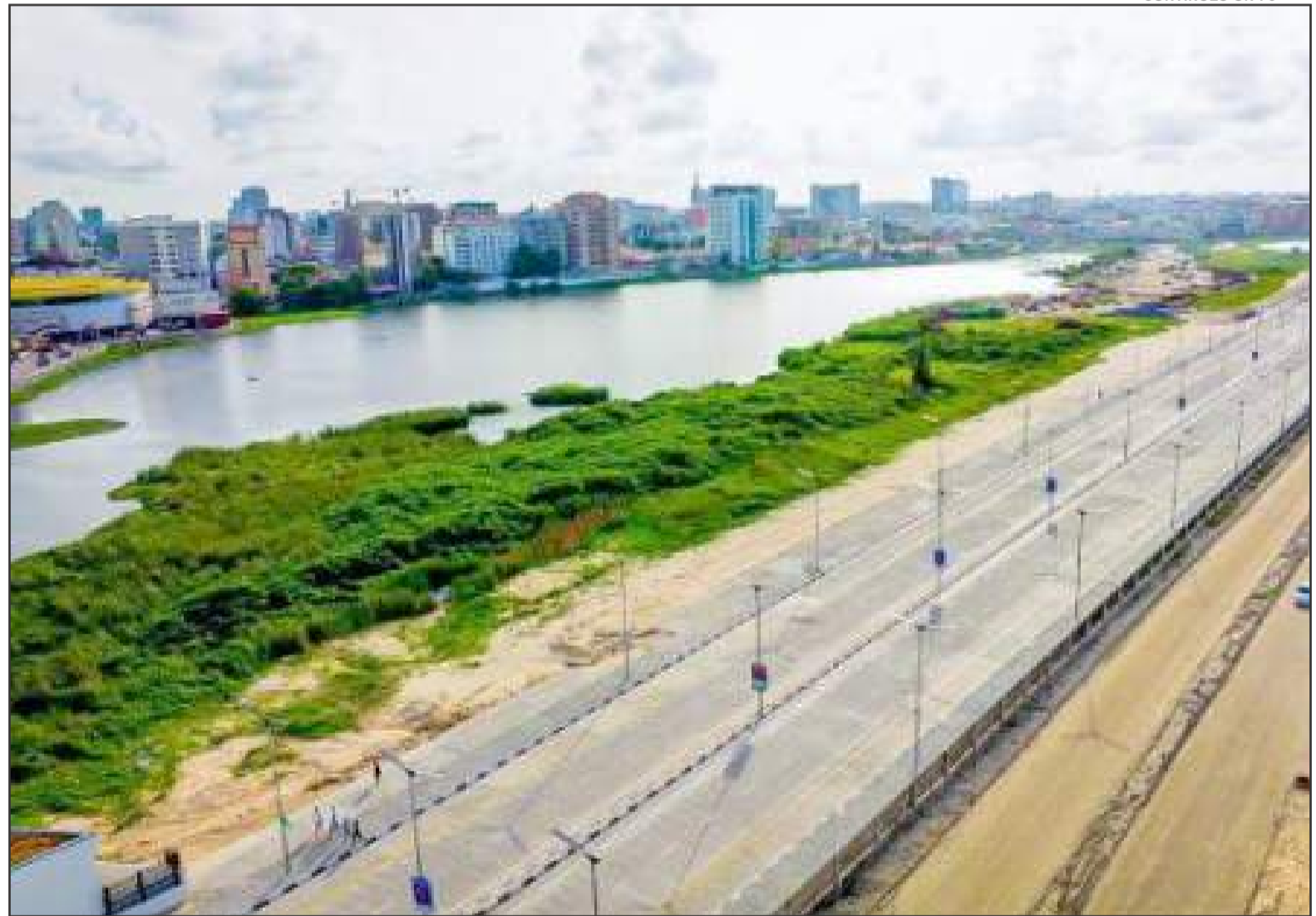
Lagos-Calabar Coastal Highway