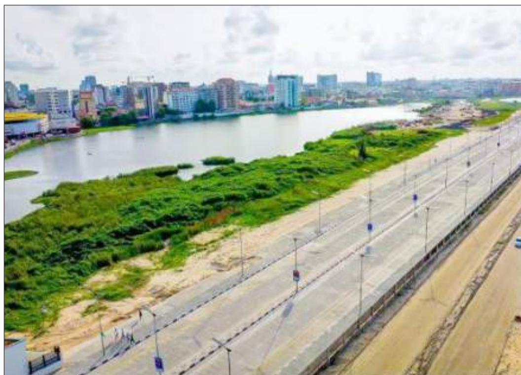
Lagos Calabar Coastal Highway

very highly, they are very courageous, as you can see from every section of the construction work. You see the sophisticated equipment deployed by Hitech, so I commend them very highly and particularly for the quality of work, any of the certificate that comes will be approved without hesitation, because we've been here and acknowledged the great work being done."