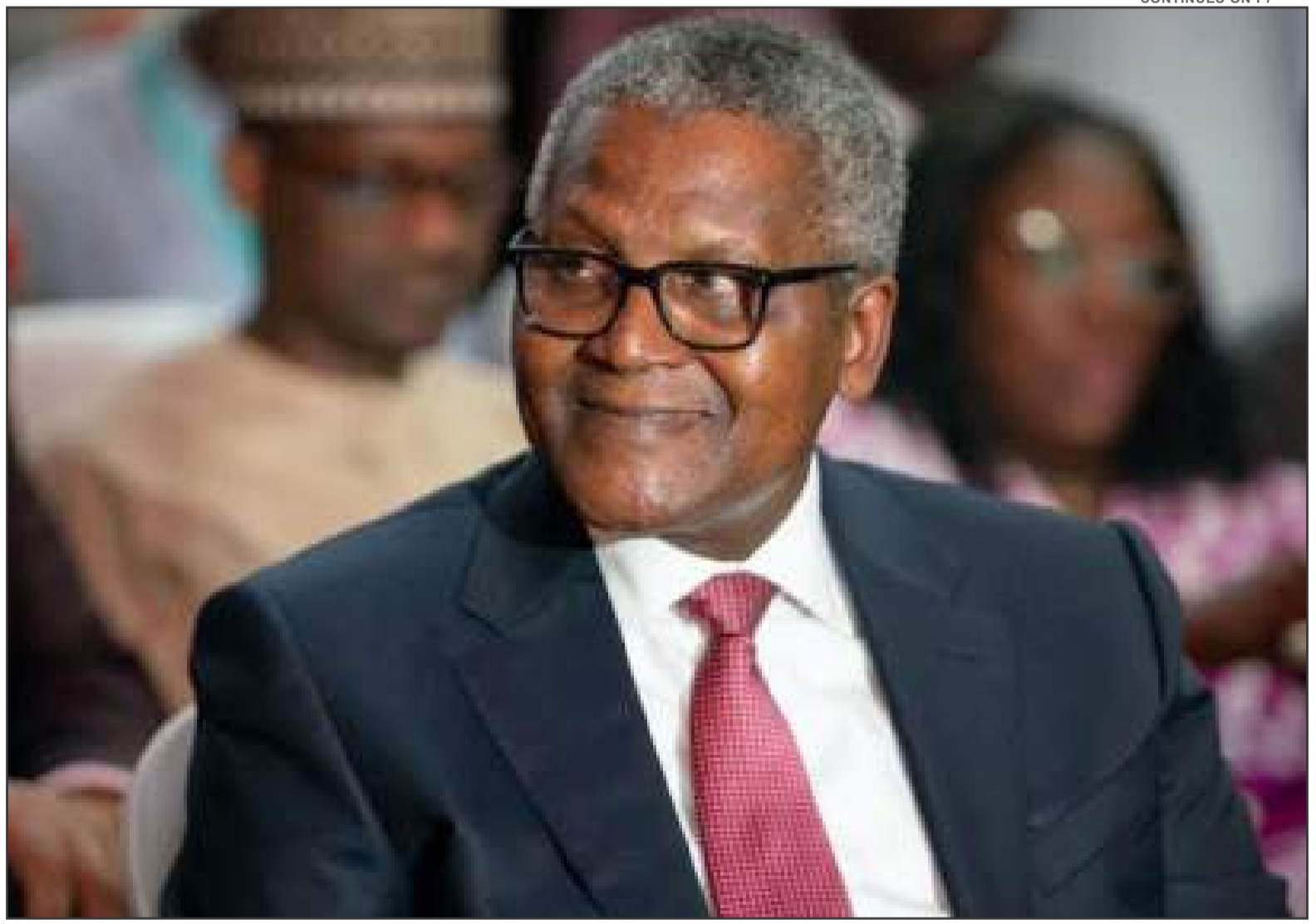
Alhaji Aliko Dangote, Chairman Dangote Group

Five Dead, Others Injured In Ebonyi Road Accident P5