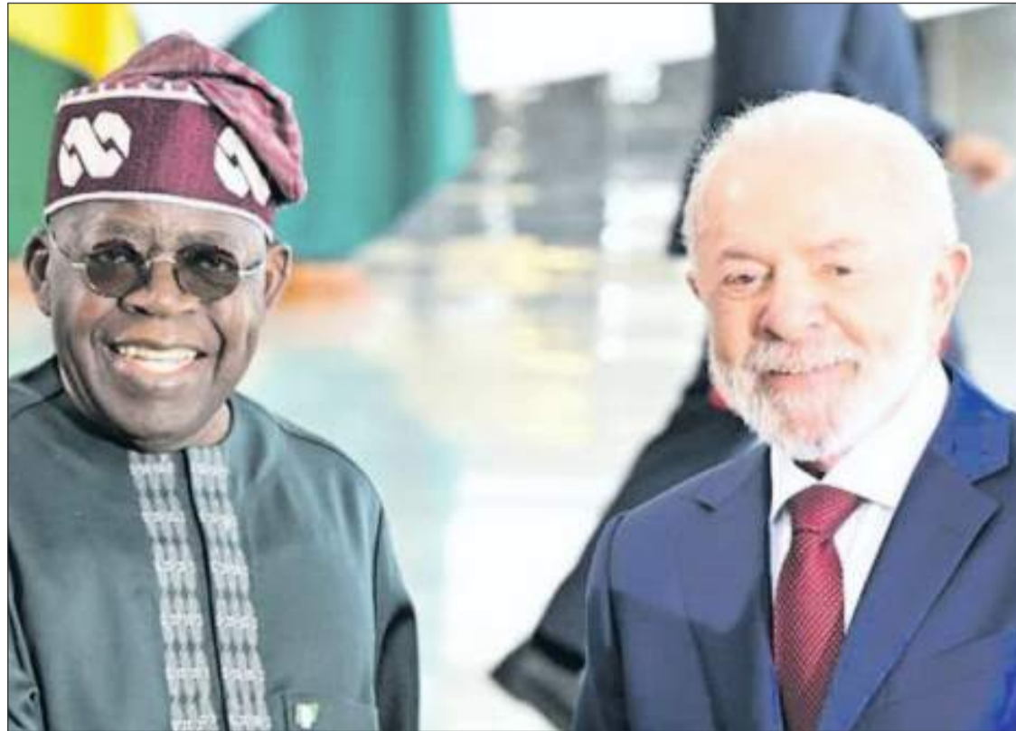
Nigeria, Brazil sign five MoUs

The President praised his Brazilian counterpart, Luiz Inácio Lula da Silva, for committing to revitalising