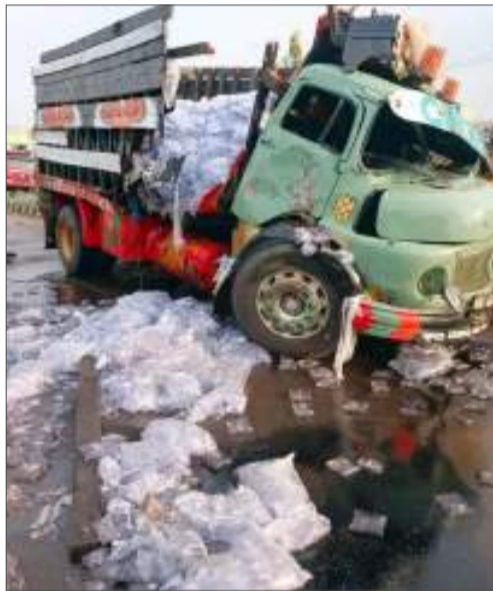
The accidental bus

"Families are mourning, and survivors are battling for their lives, all of which could have been avoided with better traffic management and enforcement practices," he said. Find Full Story In The Link