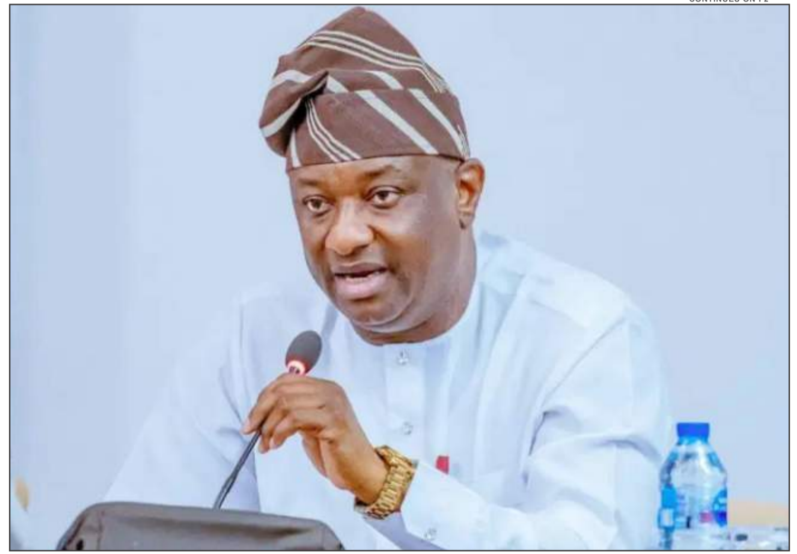
Minister of Aviation, Festus Keyamo