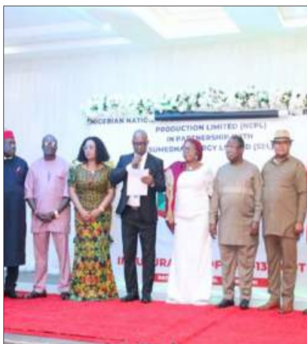
Sumedha Energy Limited

The Nigerian National Petroleum Company Exploration & Production Limited (NEPL) in partnership with Sumedha Energy Limited (SEL), officially inaugurated the Board of Trustees (BOT) for the OML-13 Host Communities Development Trust (HCDDT) in Akwa Ibom state.