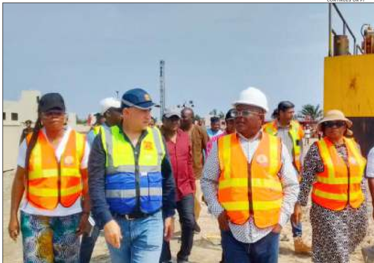
Senator David Umahi inspecting the Lagos-Calabar road