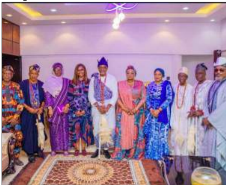
Women Empowerment Programme

Culled: The Nigerian Government has reaffirmed its commitment to advancing women's empowerment, inclusive governance, and social protection through the Renewed Hope Agenda, positioning Nigeria as a continental