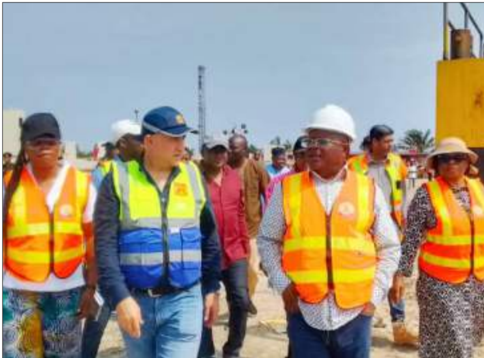
Senator David Umahi inspecting the Lagos-Calabar road

Addressing contrary opinions by some members of the public, Umahi said, "The