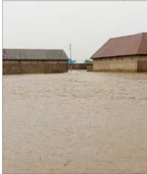
The flooded area