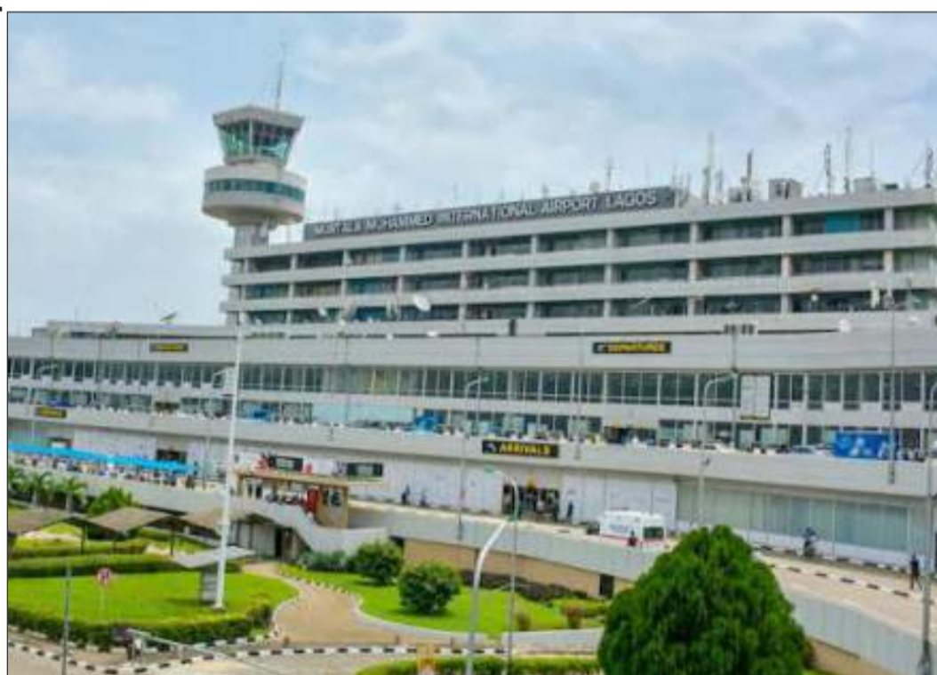
Murtala Muhammed International airport