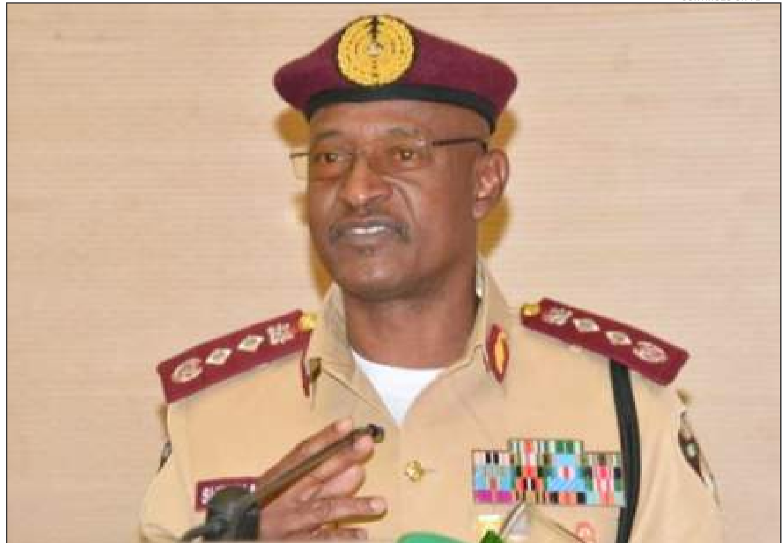
Shehu Mohammed, FRSC Boss