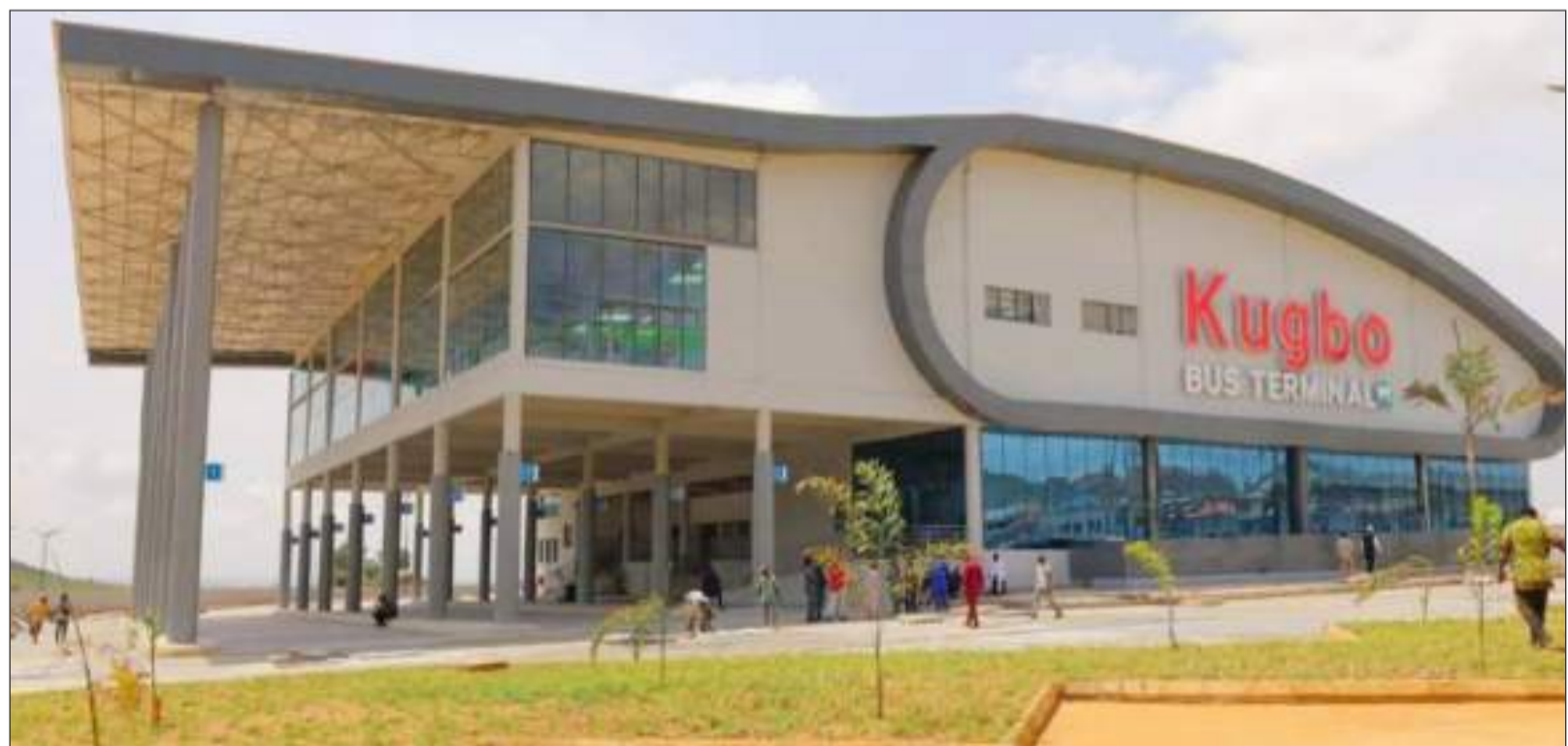
Kugbo Bus Terminals

In May 2024, Wike awarded the contract for the construction of the three modern bus terminals.