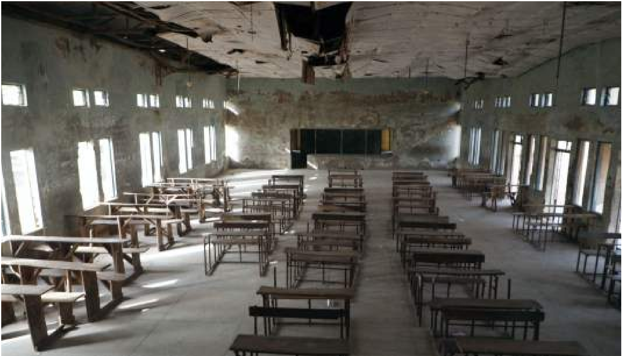
an empty classroom