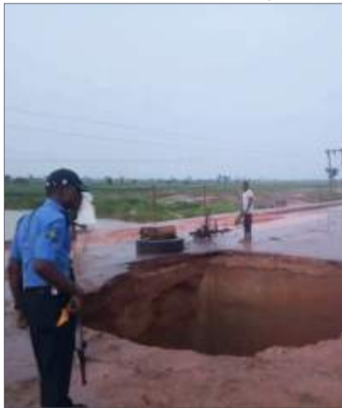
The Bridge collapse

He said the command had already deployed its personnel to guide travellers