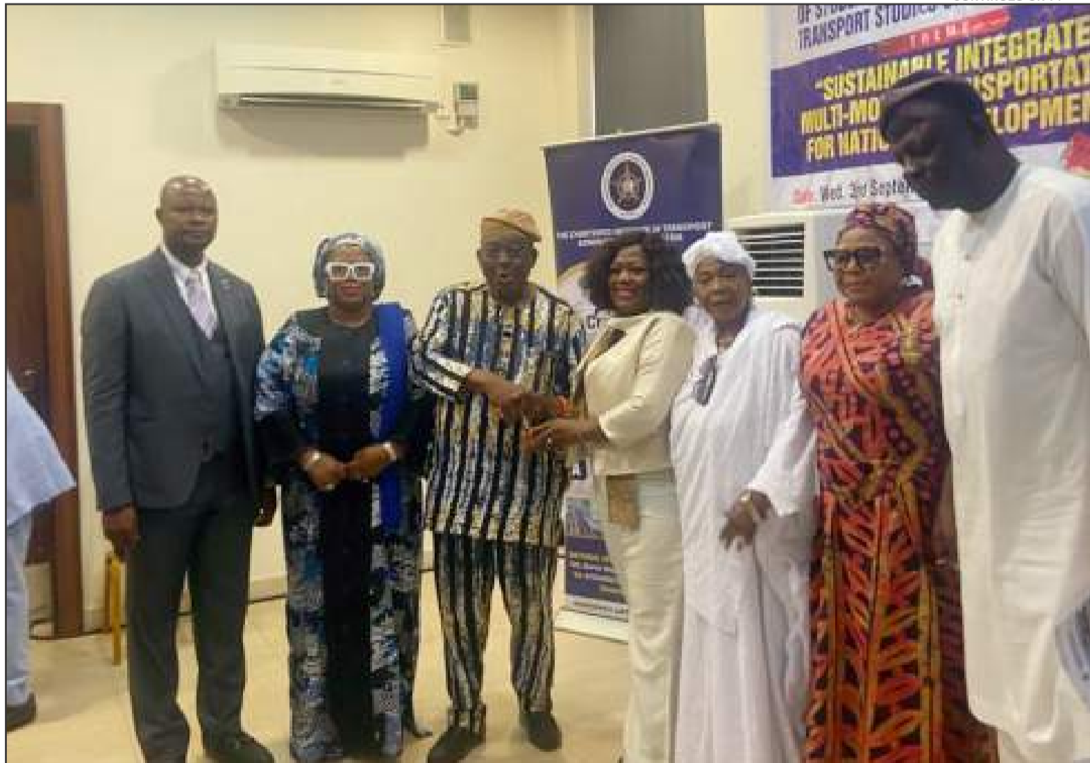
CloTA, UNILAG unveil next generation of transport leaders