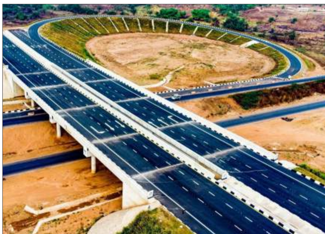
Circular Road Project

you. We are still expecting them to come for screening so that we will be able to affect the people," he added.