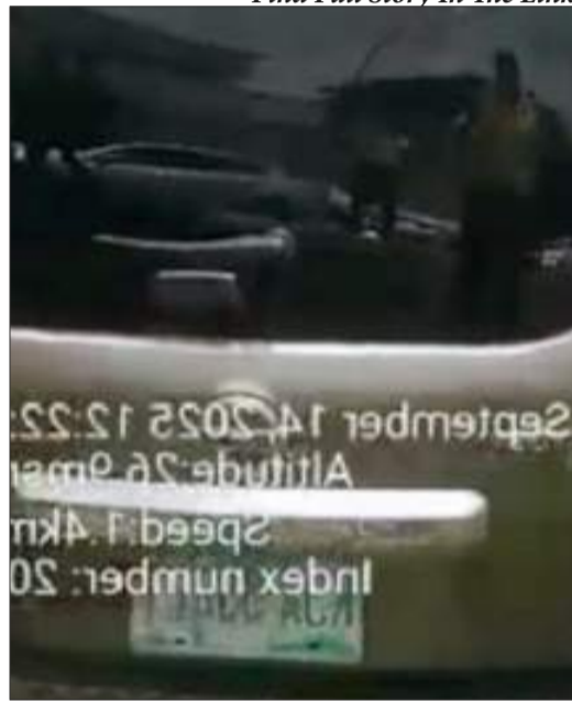
Hit and run car