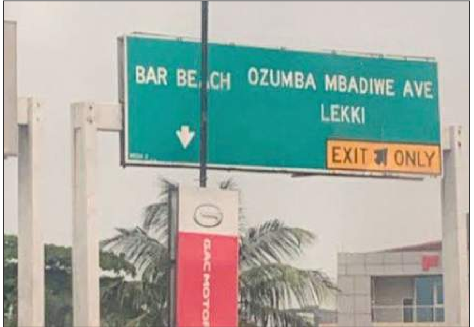
Ozumba Mbadiwe Way