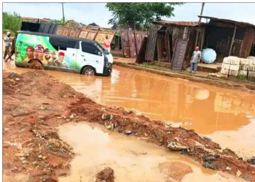
Poor state of a particular rural road

Owerri West Local Government Area and across other LGAs in Imo State remain in deplorable condition.