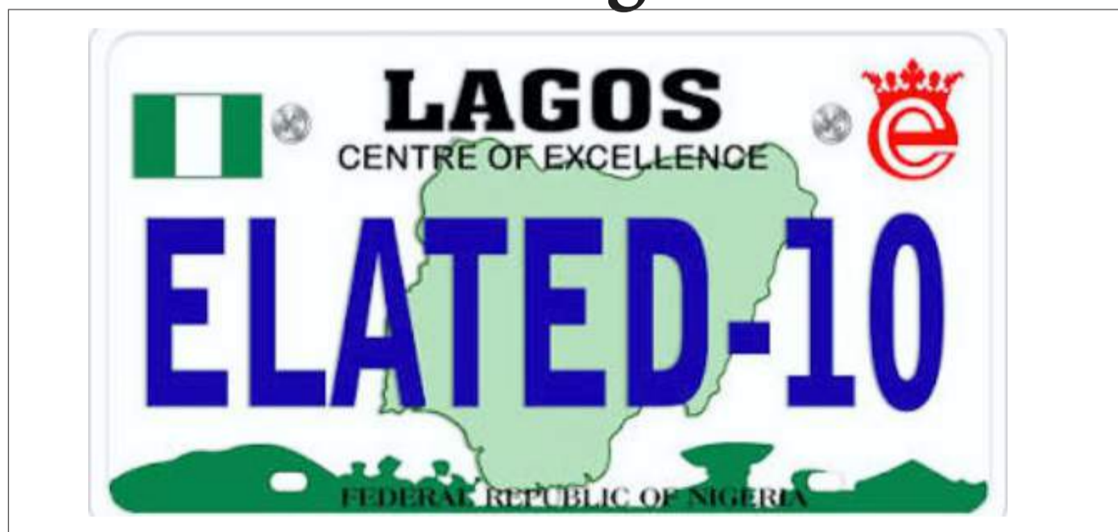
Sticker plate number

The LASTMA boss assured that the agency, in collaboration with security