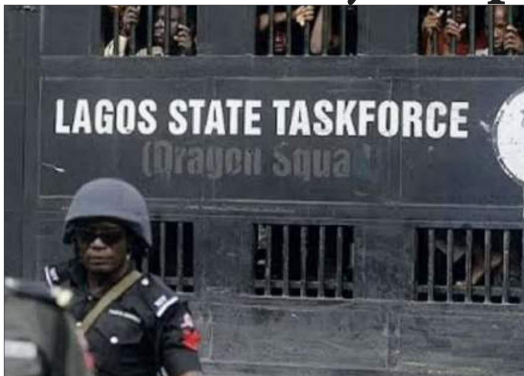
Lagos State Taskforce