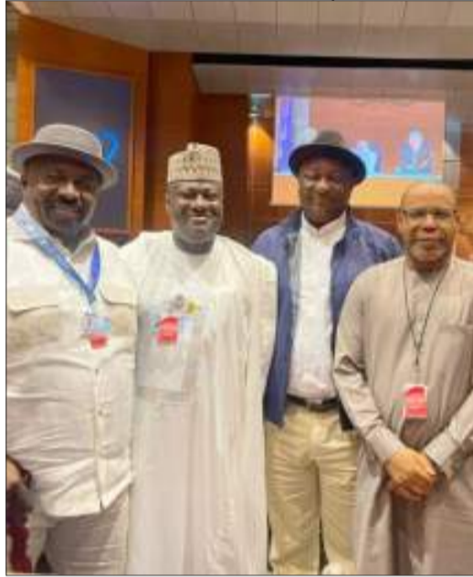
Stakeholders at the ICAO