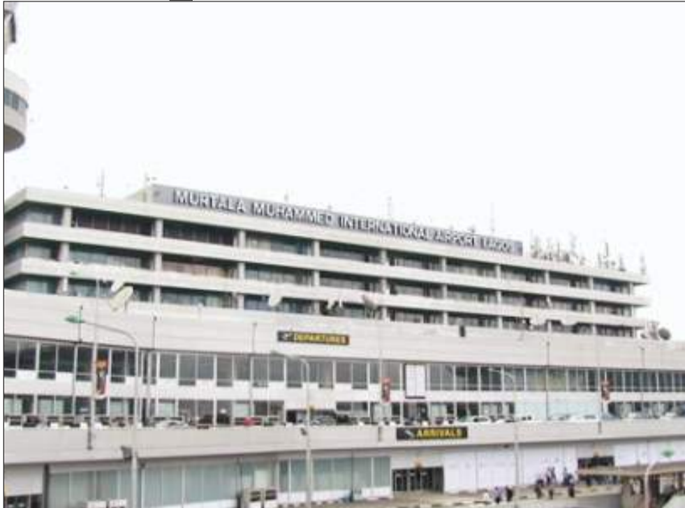
Murtala Mohammed Int'l airport

FAAN insisted that, effective from September 29, 2025, all payments to the authority will be made using a contactless payment method.