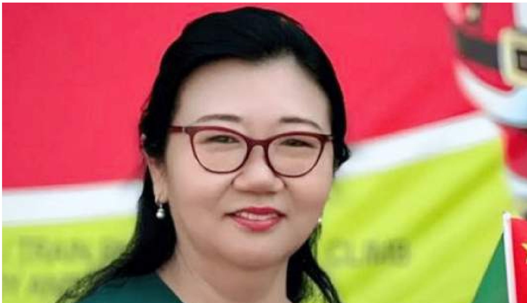
Chinese Consul General in Lagos, Yan Yuqing