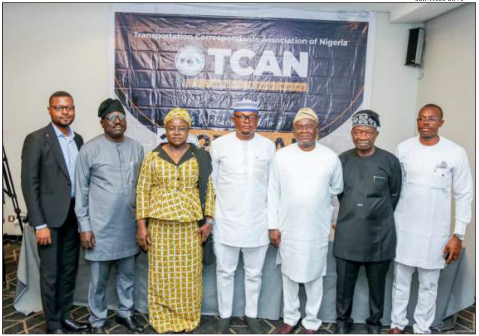
Stakeholders at the TCAN Summit