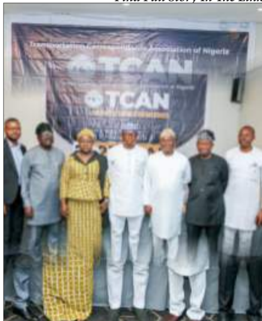
Stakeholders at the TCAN Summit