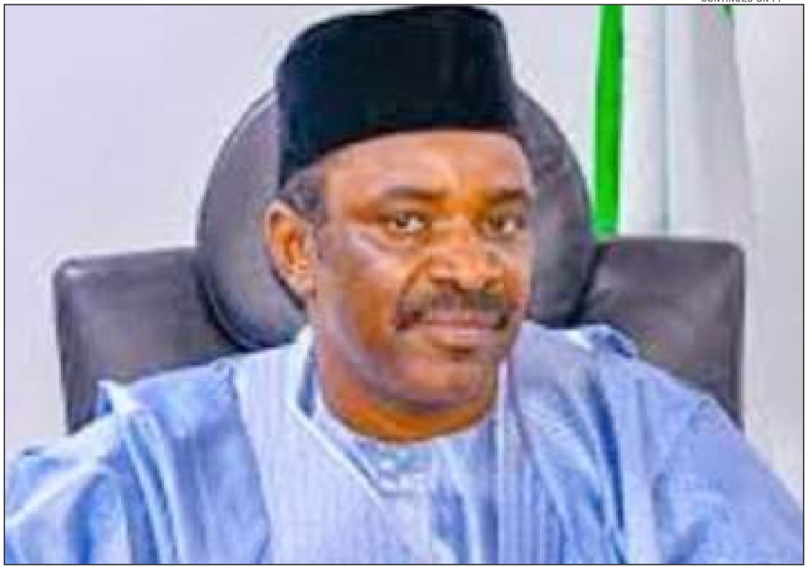
Minister of Transportation, Alhaji Saidu Alkali