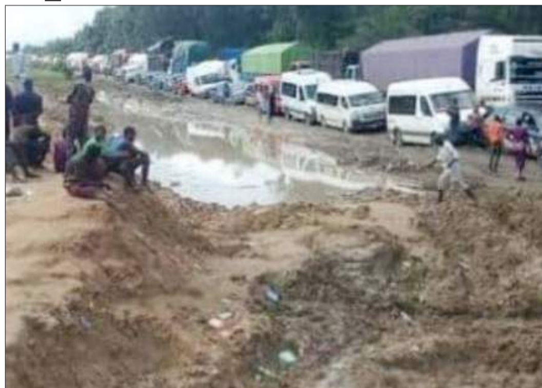
The Benin-Sapele Road

Signs of hope emerged when the Edo State Government took over a portion of the rehabilitation earlier handled by Levant Construction Firm. However, residents say progress has remained slow and conditions continue to