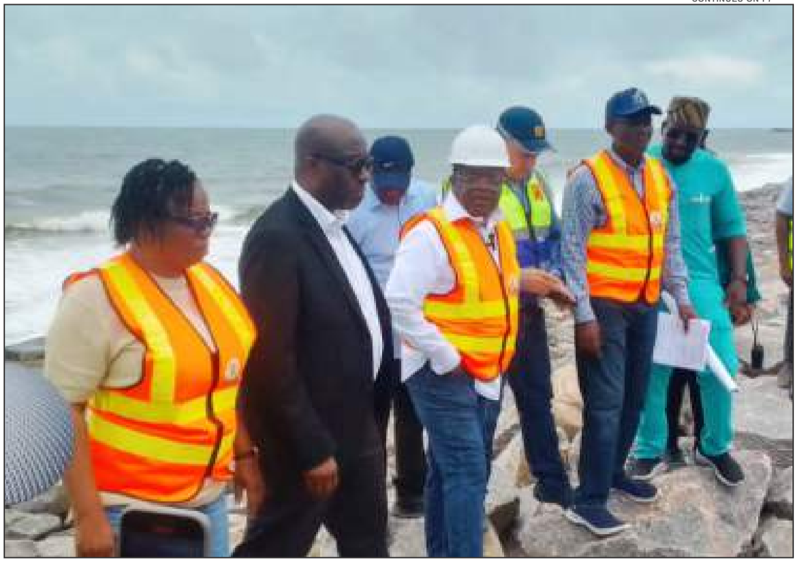
Senator David Umahi inspecting the Coastal road with stakeholders