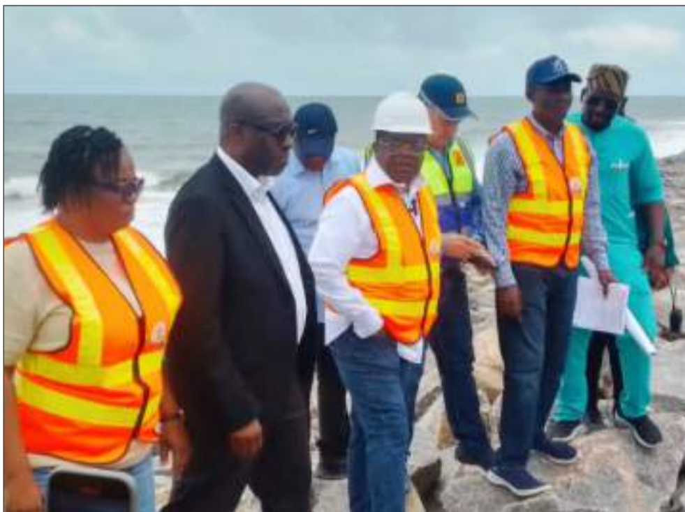
Senator David Umahi and stakeholders

He however called on the Media and Civil Society Groups, to open a full scale investigation on illegal land acquisition, particularly the alleged $250 million diaspora remittances sunk into real estate investments by Winhomes properties, who alleged that the Federal government demolished her multi-million dollar investment along the Lagos-Calabar coastal highway corridors to pave way for the gazetted alignment of the coastal highway project.