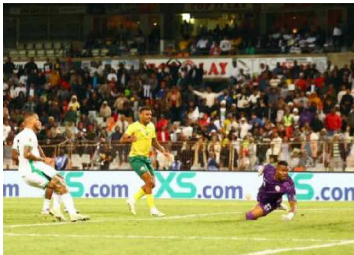
Nigeria vs South Africa

African defence from the edge of the box, but his effort was well blocked.