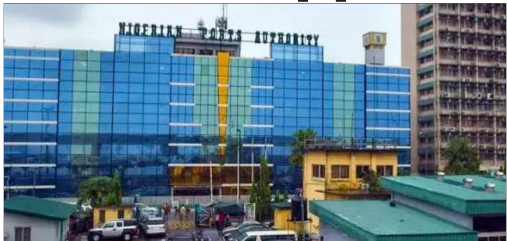
Nigerian Ports authority

In line with efforts to promote environmental sustainability, Lawal disclosed that four terminals had recently received warning letters for breaching their lease agreements and contributing to pollution within the Apapa Port