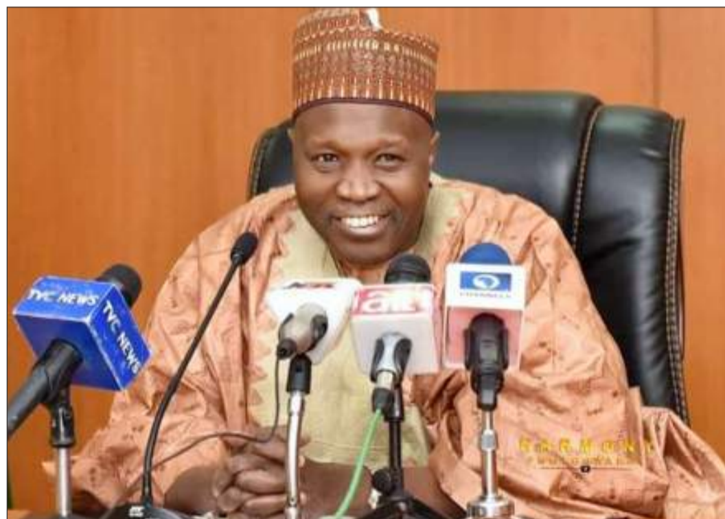
Governor Inuwa Yahaya

Kallamu reiterated the Governor Inuwa Yahaya administration's commitment to