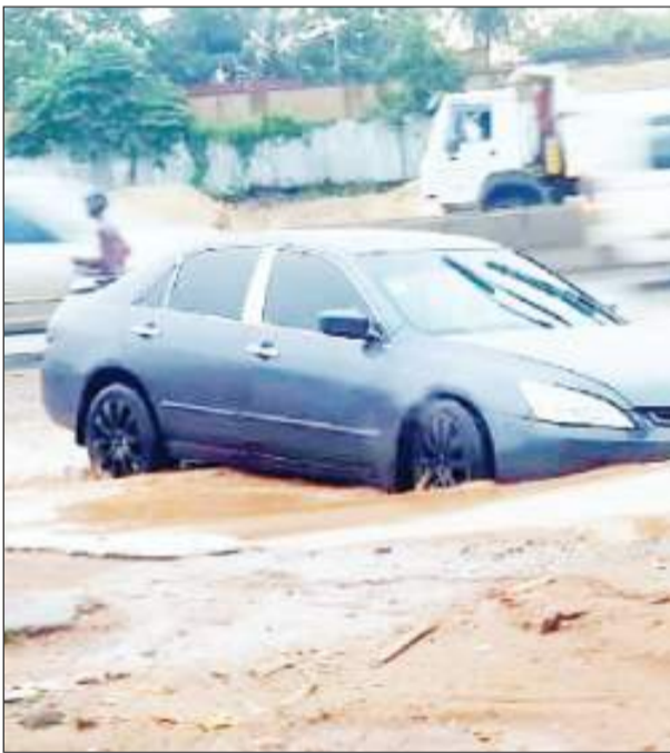
The flooded area

Motorists and commuters were stranded along the Ikorodu Road area of Lagos State after a downpour on Monday caused heavy flooding along the axis.