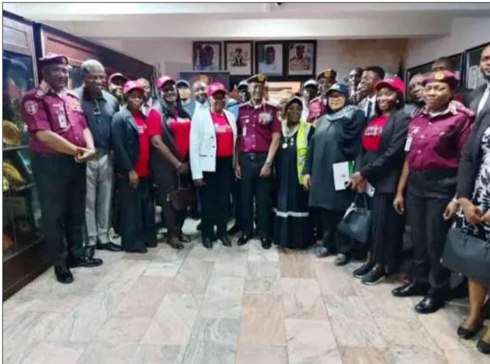
Stakeholders at the press briefing on IRCVAC

"The essence of this conference is to bring