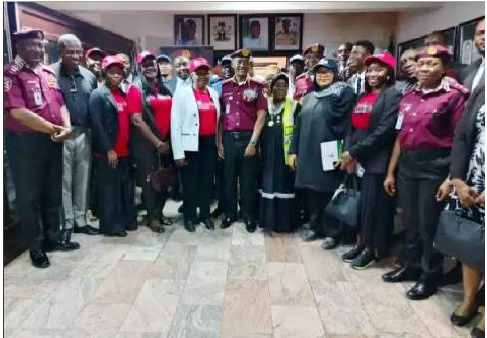
Stakeholders at the press briefing on IRCVAC