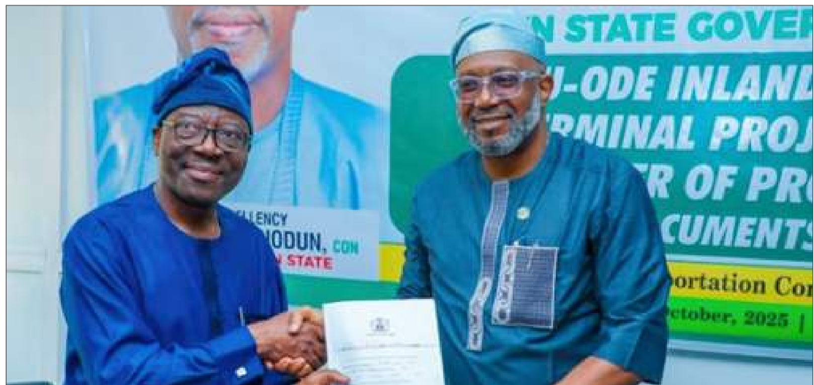
Ijebu-Ode Inland Dry Port

"The federal government remains committed to completing the Ijebu-Ode