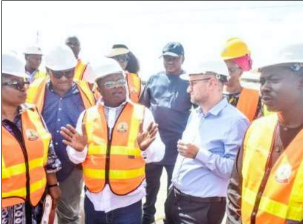
Senator David Umahi with stakeholders at the Abuja-Keffi road

"It took several interventions to get China Harbour to maintain the other carriageway they were not working on. This level of indiscipline and disregard for public interest will no longer be tolerated.