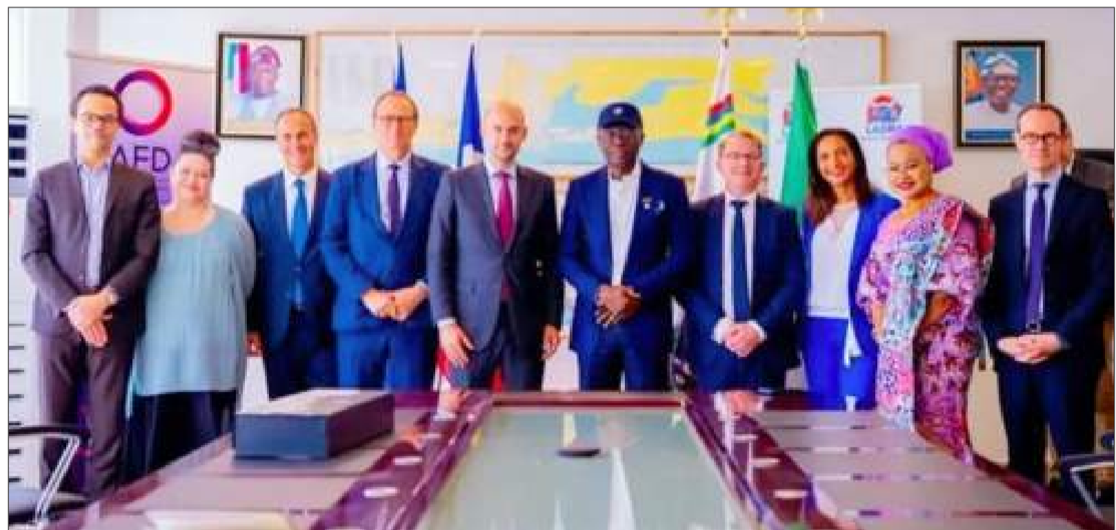
The Omi Eko Water Transportation Project

"Lagos began as a network of islands. It was knitted together by water long before the bridges connected us, connecting us as a people and to our dreams. The waters were used to deliver our goods and people across the lagoon, prompting us to be deliberate about returning to those routes, not nostalgically, but strategically." Sanwo-Olu said.