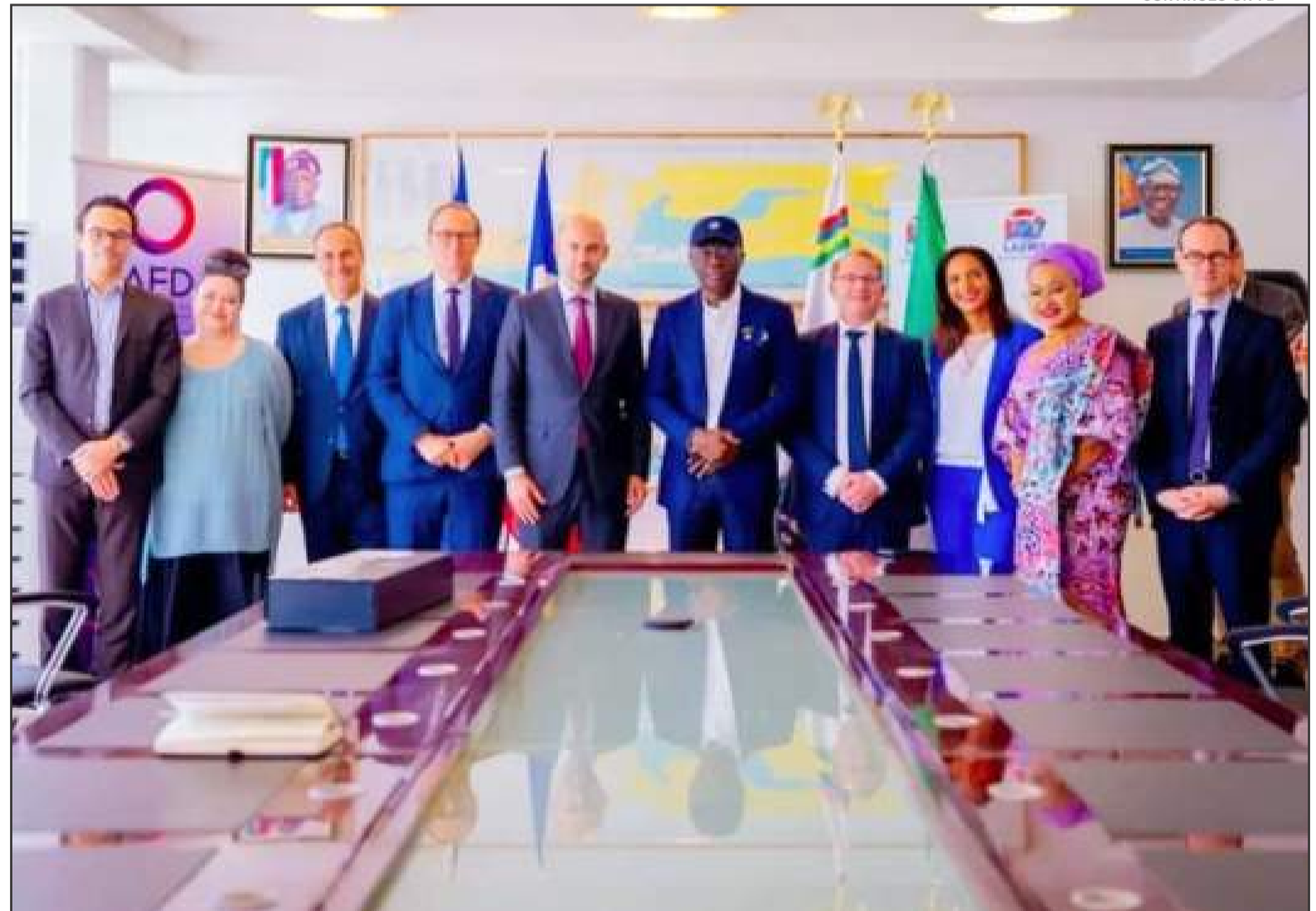
Governor Babajide Sanwo-Olu and other stakeholders at the Omi Eko Water Transportation Project