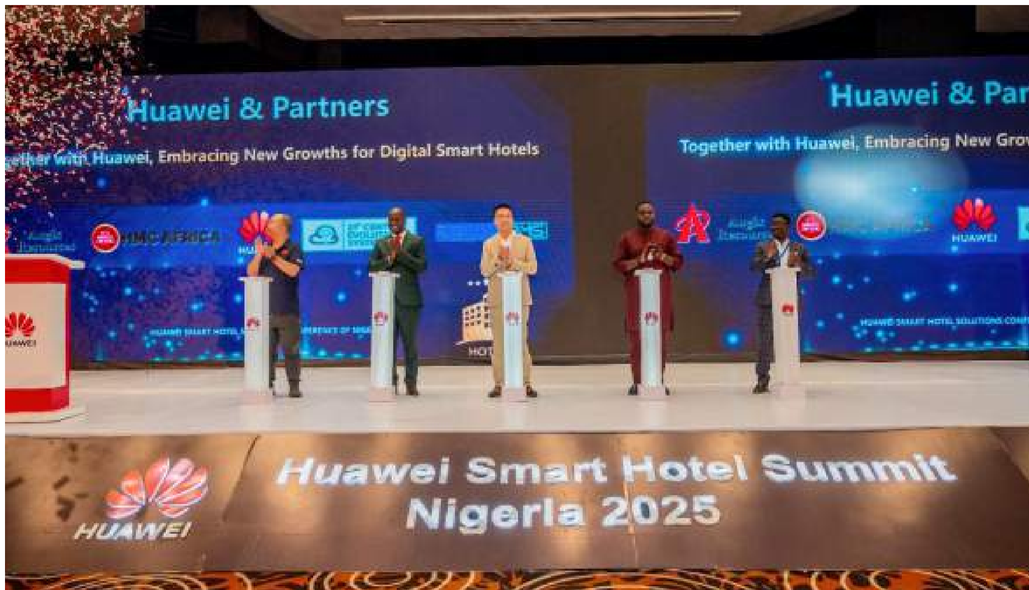
Huawei Summit 2025