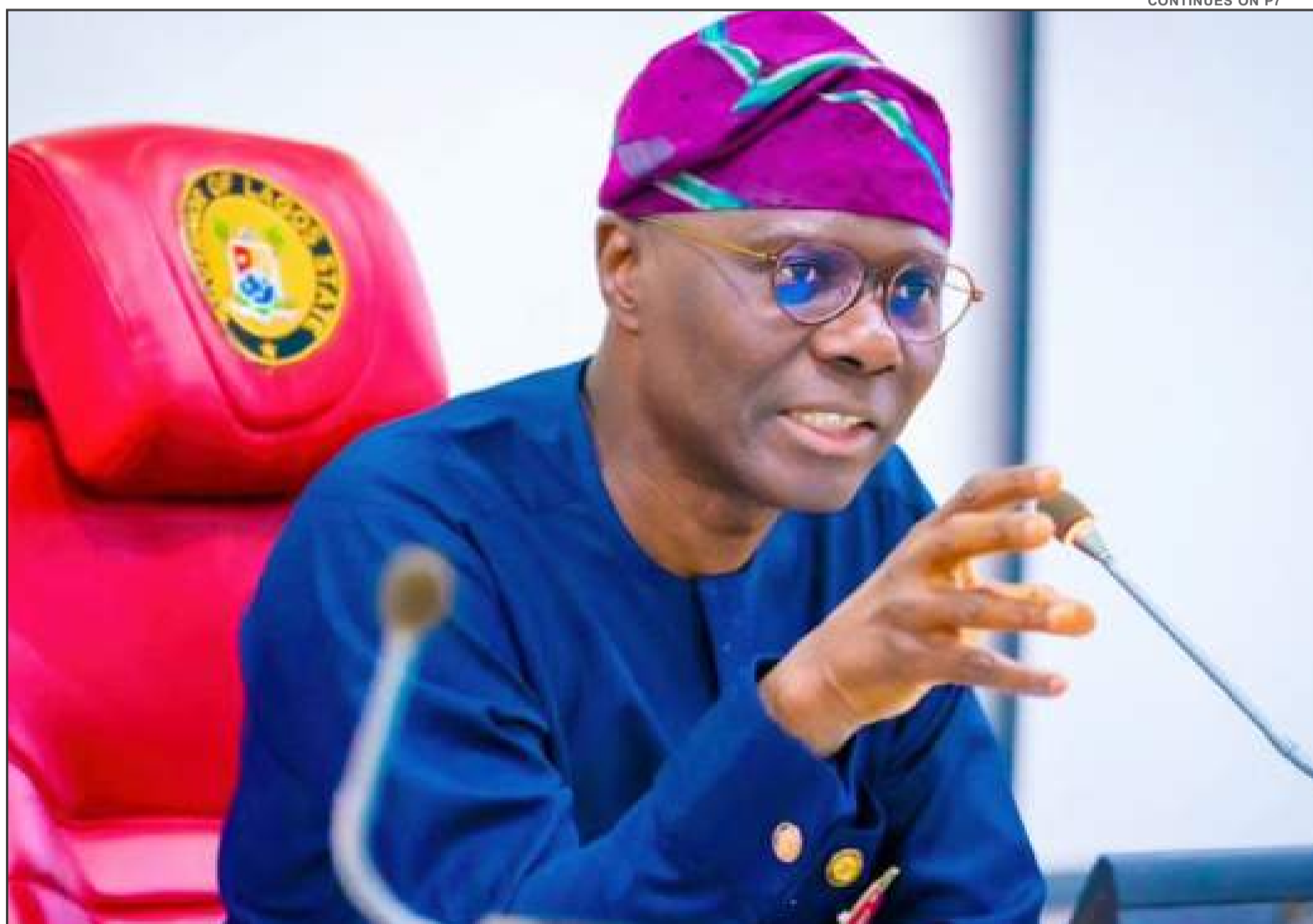
Governor Babajide Sanwo-Olu, Governor of Lagos State