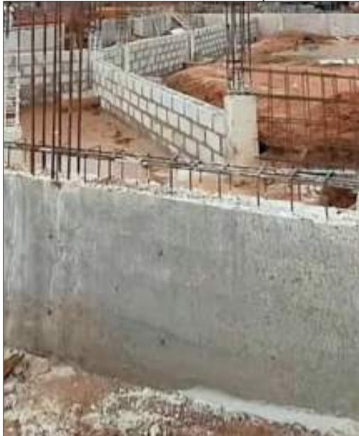
The new bus terminal under construction