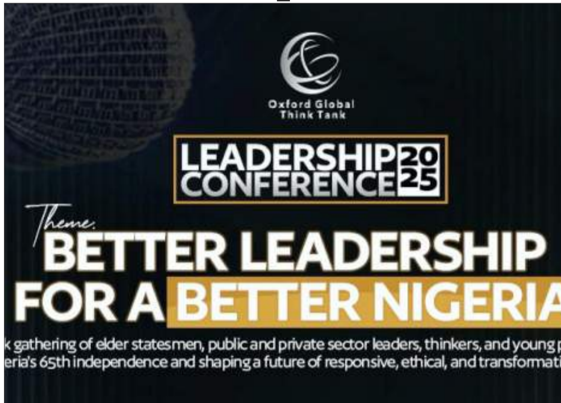
Oxford Leadership conference

Also expected are Governor Alex Otti of Abia State, economist and banker Atedo Peterside, ex-Secretary to the Government of the Federation Anyim Pius Anyim, former Ekiti State Governor Dr. Kayode Fayemi, Minister