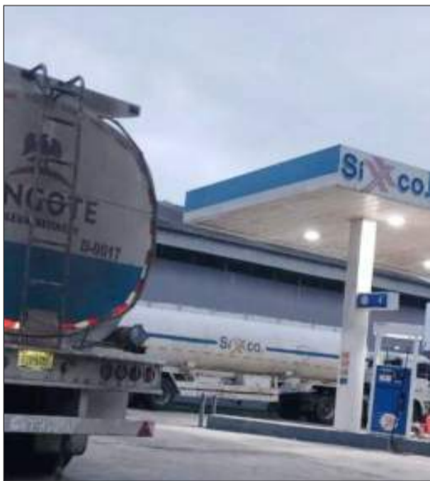
Sixxco Oil Ltd

Sixxco Oil Ltd, a leading oil marketing company, has commenced direct receipt of petroleum products from the Dangote Refinery and Petrochemical Company Ltd under its Direct Delivery Scheme.