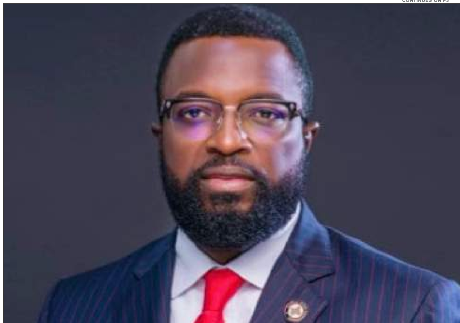
Honorable Commissioner of Transportation, Mr Oluwaseun Osiyemi