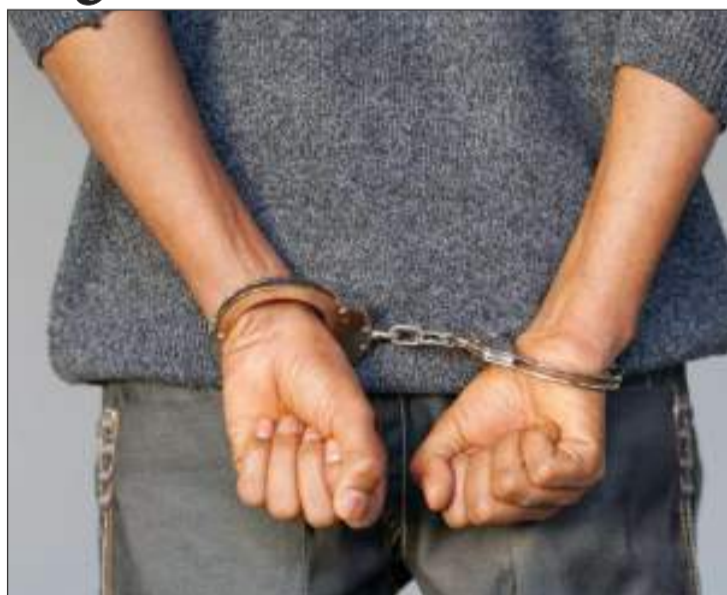
A man in handcuffs

Culled: The Anti-Narcotics Cell (ANC) of the Mumbai Police in India has arrested a Nigerian national following the seizure of 523 grams of cocaine valued at approximately ₹5.23 crore (worth about N861,705,887.60) during an early morning operation on Saturday. According to https://www.lokmatimes.com police sources said the operation was conducted at 4:15 a.m. near Diamond Ayva Hostel on Hansmukh Road, Vakola,