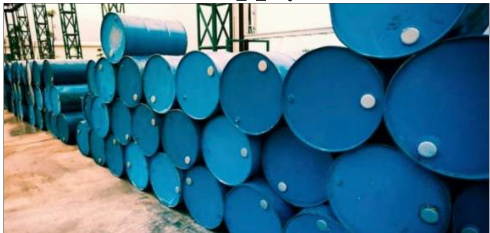
Crude oil barrels

"The executive has taken bold and decisive steps by removing long-