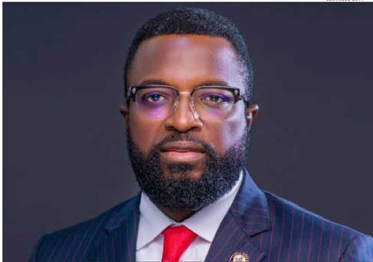
Mr Oluwaseun Osiyemi, Honorable Commissioner for Transportation