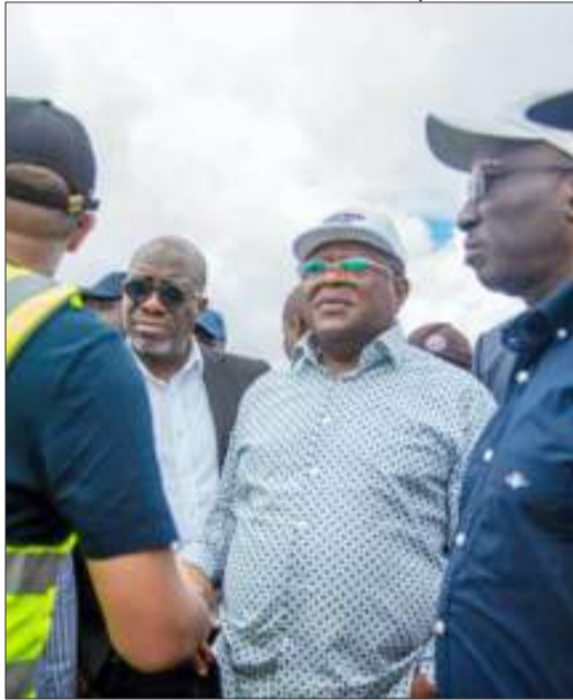
Senator Umahi representing Tinubu