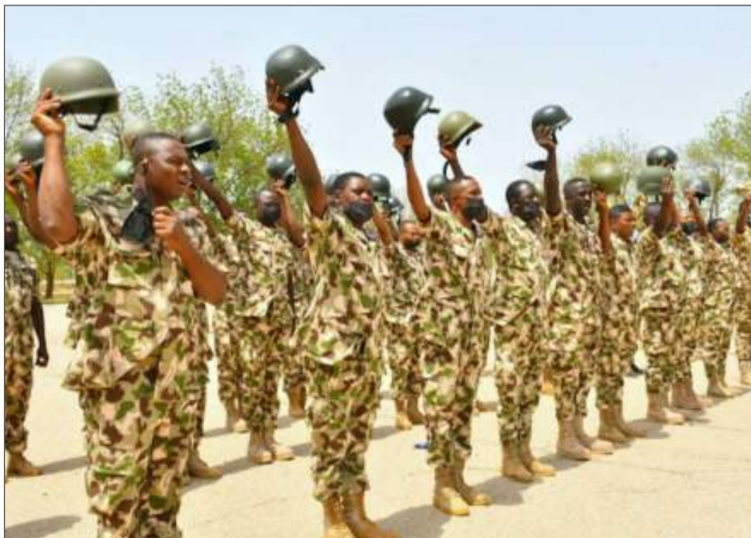
The Nigerian Army

The statement reads, "Determined to end the cycle of oil theft, pipeline vandalism, and associated crimes in the Niger Delta Region, troops of 6 Division, Nigerian Army, have scaled up both kinetic and non-kinetic lines of