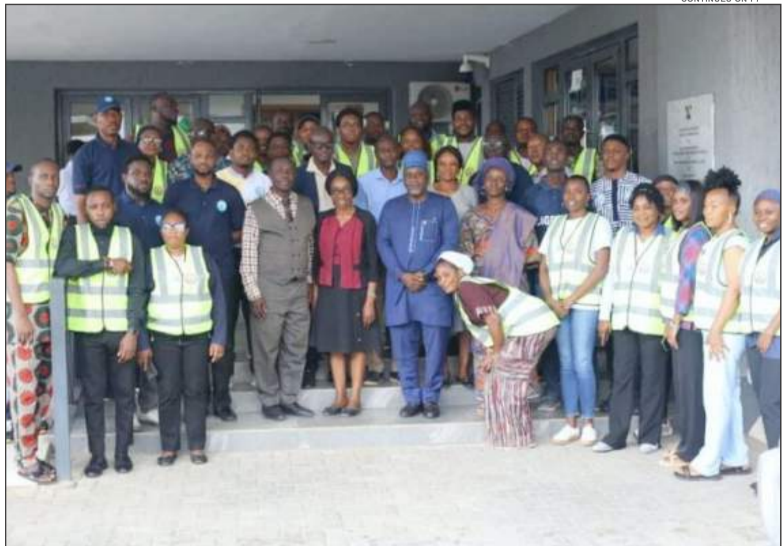
Stakeholders at the training held at the Debt Management Office in Ikeja