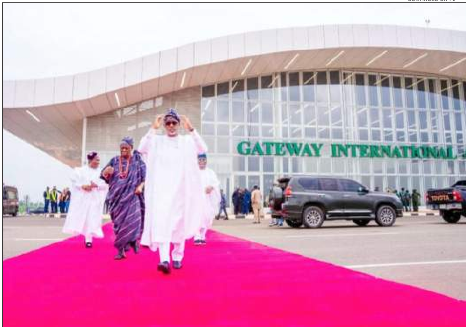
Governor Dapo Abiodun at the Gateway International Airport