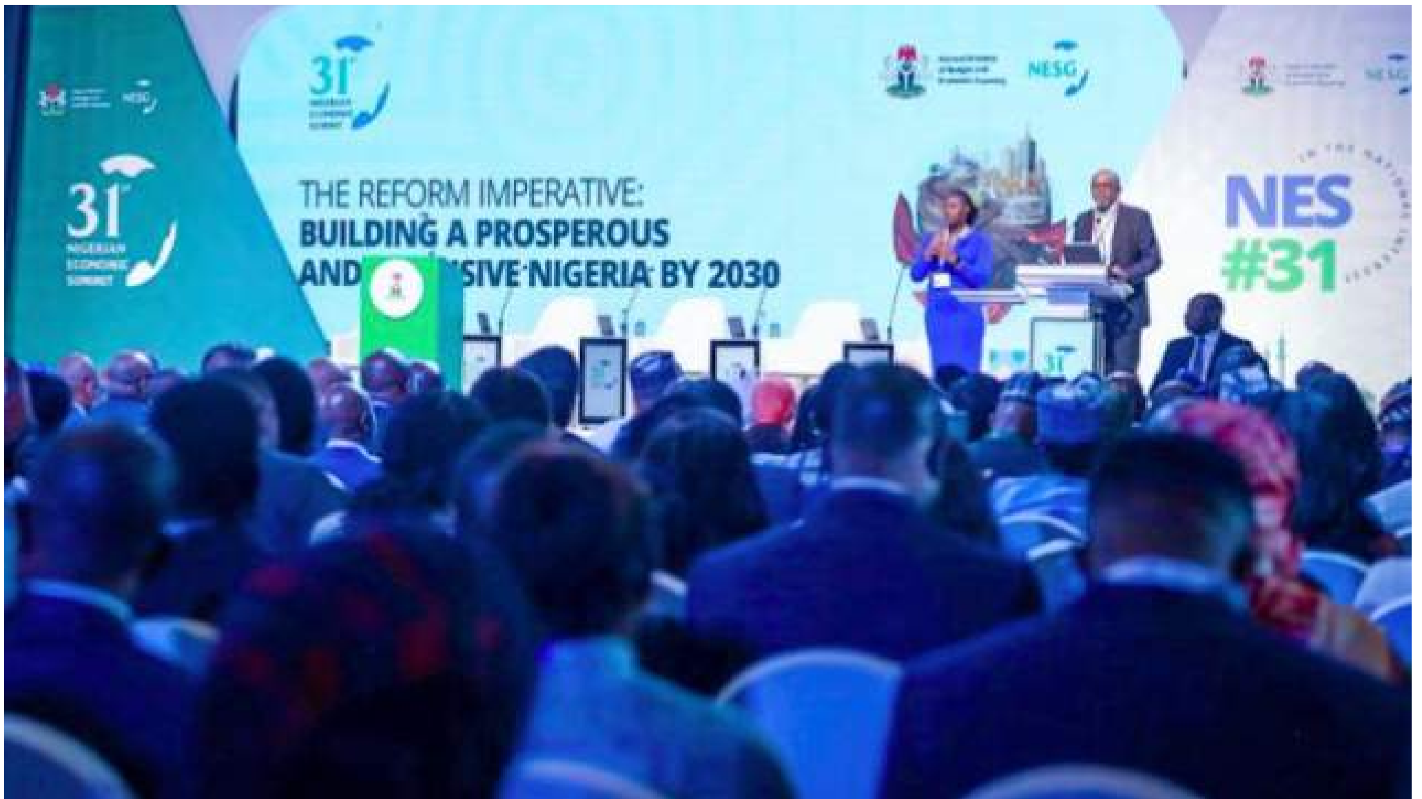
NESG Abuja Summit