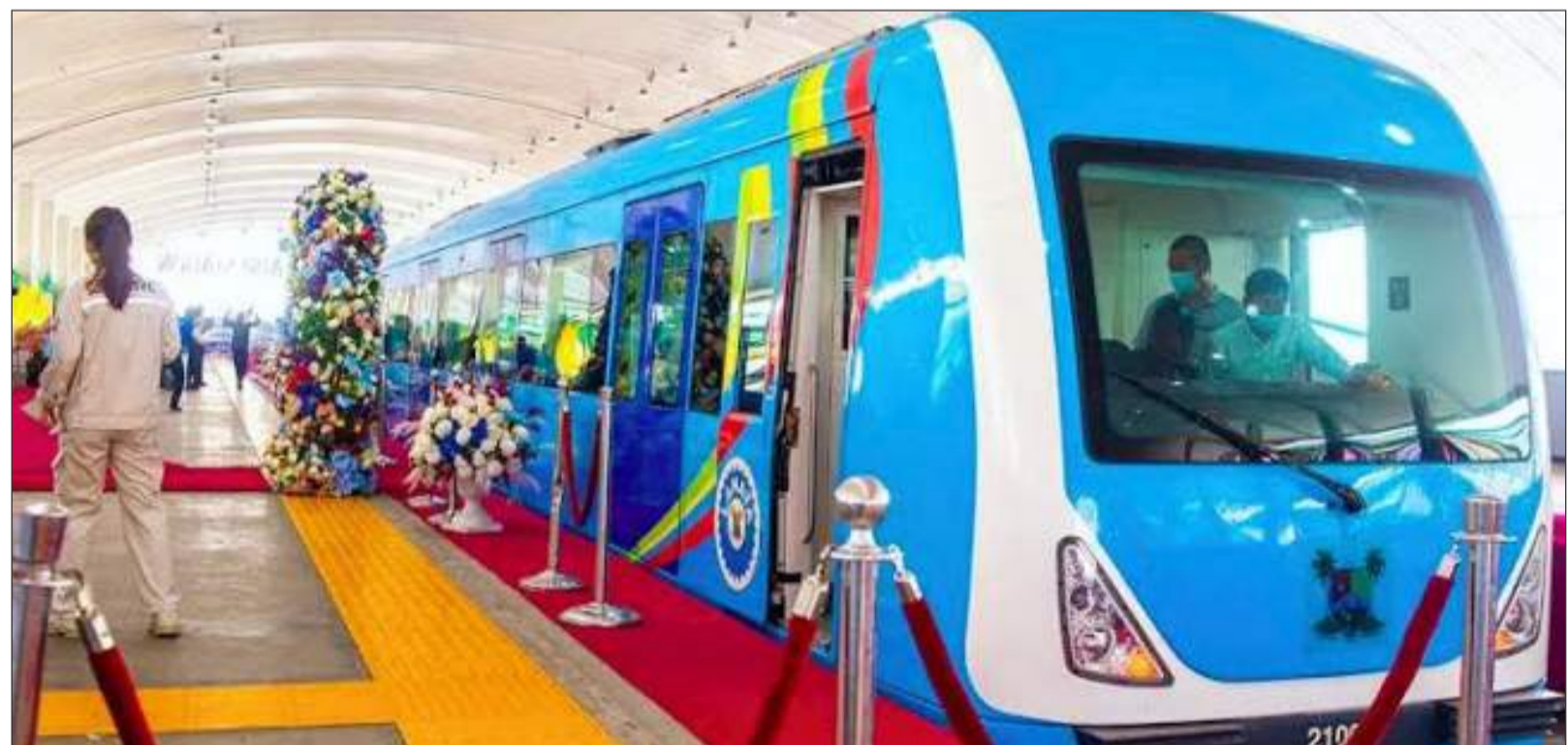
LAMATA partners Greenplinth Africa Limited

Under the agreement, Greenplinth Africa will serve as consultant and strategic partner, leading the development of a comprehensive carbon credit portfolio for existing and future transport projects. The company will also design a carbon financing