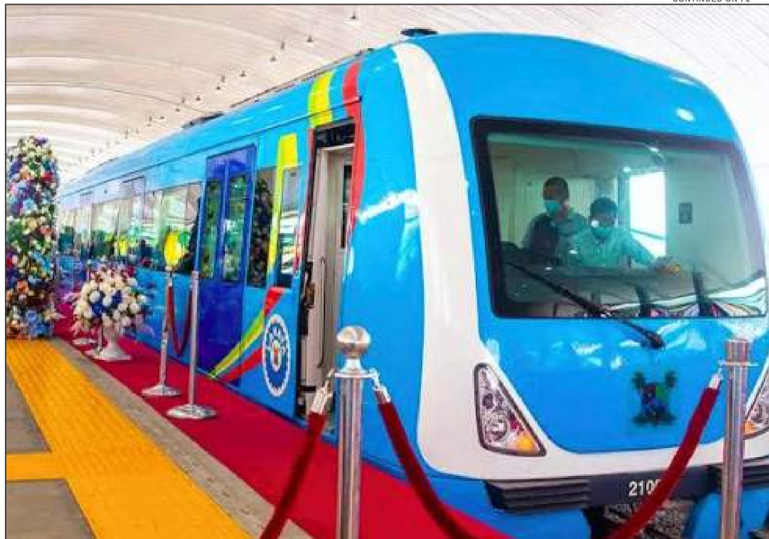
LAMATA partners Greenplinth Africa Limited