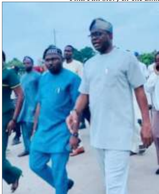
Oyo govt partners pacesetter transport