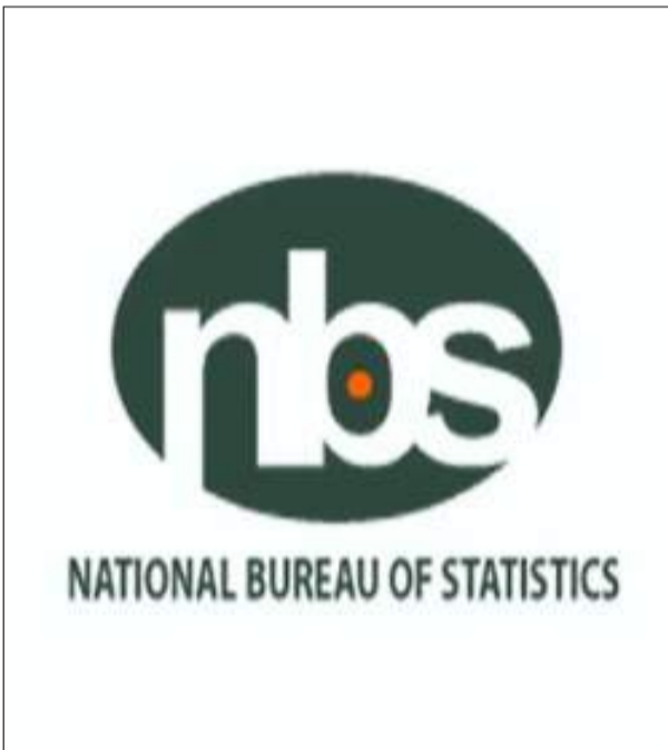
National Bureau of Statistics NBS

Aviation sector growth crashed to 2.88 per cent in the third quarter of 2025, even as passengers grapple with high airfares, latest figures from the National Bureau of Statistics have shown.