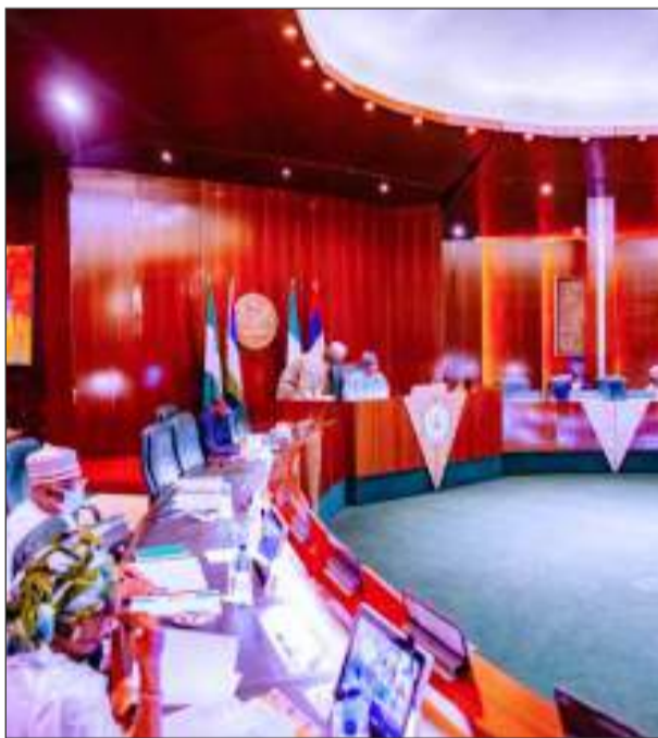
Federal Executive Council (FEC)

The Federal Executive Council has approved three major Public-Private Partnership projects valued at over N6.43tn, signaling another significant wave of private-sector investment into Nigeria's infrastructure landscape.