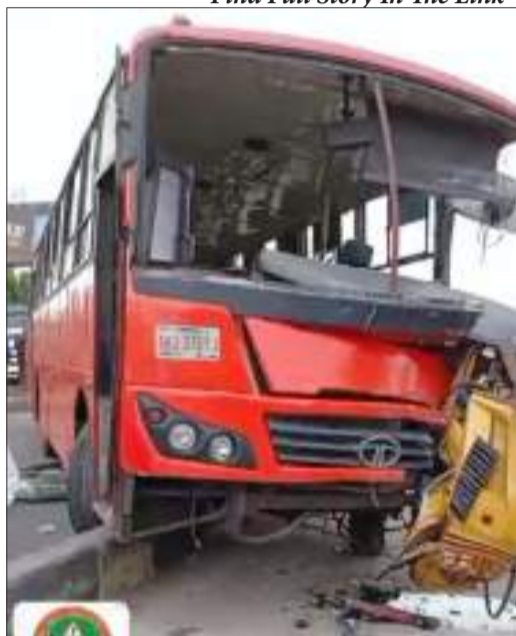
The accident scene