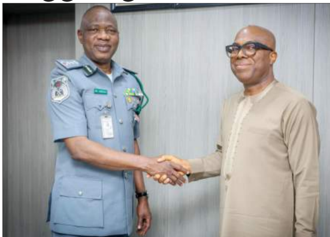
Customs partners NMDPRA

Adeniyi reaffirmed the commitment of the Customs Service to deepening interagency cooperation, particularly in preventing petroleum products intended for the domestic market from being diverted to neighboring countries. He said the partnership with NMDPRA had already yielded tangible results,