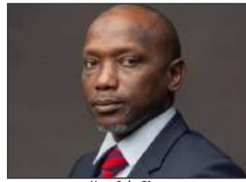
Hon. Sola Giwa