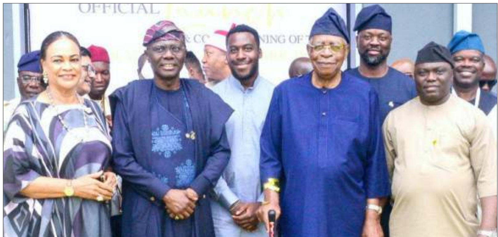
Dignitaries at the official launch of TY Logistics FZE

Located beside the Lekki Deep Sea Port and within minutes of the upcoming international airport, the 29,000 sqm facility offers over 45,000 pallet positions, advanced storage systems, and a fully automated