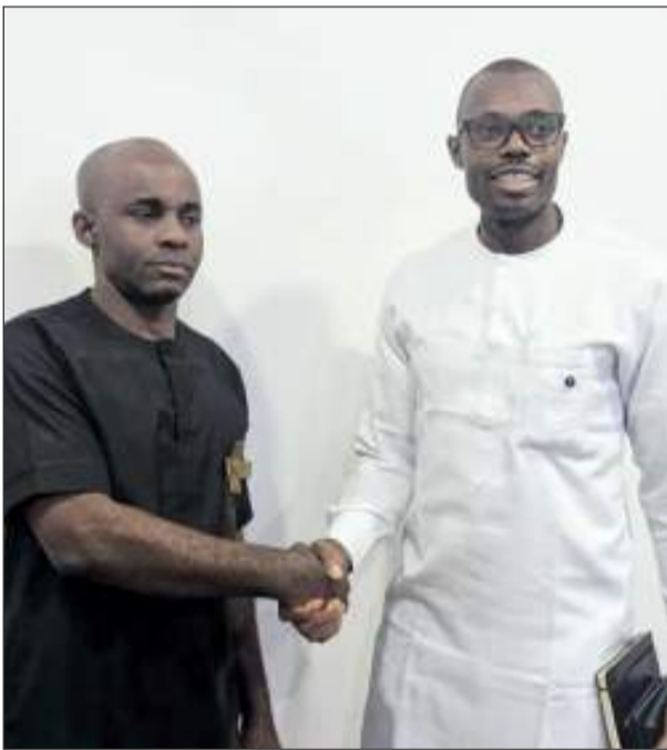
The Truck Transit Parks Limited (TTP)

The Truck Transit Parks Limited (TTP), operators of the electronic call-up system otherwise referred to as the Eto platform, said at the weekend that 900,000 trucks entered and exited the Apapa and Tin-Can Ports in Lagos between January and November 2025 using the platform.