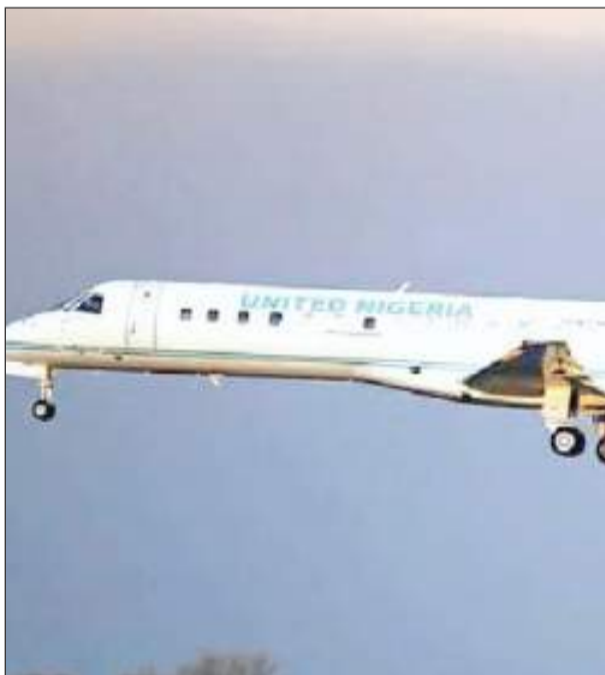
United Nigerian airline

Air travel in the country has recorded a notable rise as more travellers are increasingly avoiding long road journeys due to growing safety concerns.