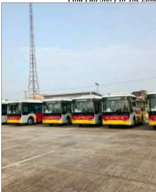
Abia Launches Electric Buses