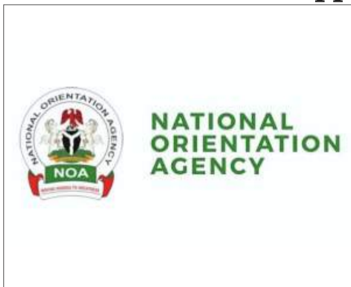
NOA (National Orientation Agency)

Culled: The National Orientation Agency (NOA) has reiterated its commitment to pushing for public support for the effective implementation of the Federal Government's tax reforms, which are scheduled to take effect in