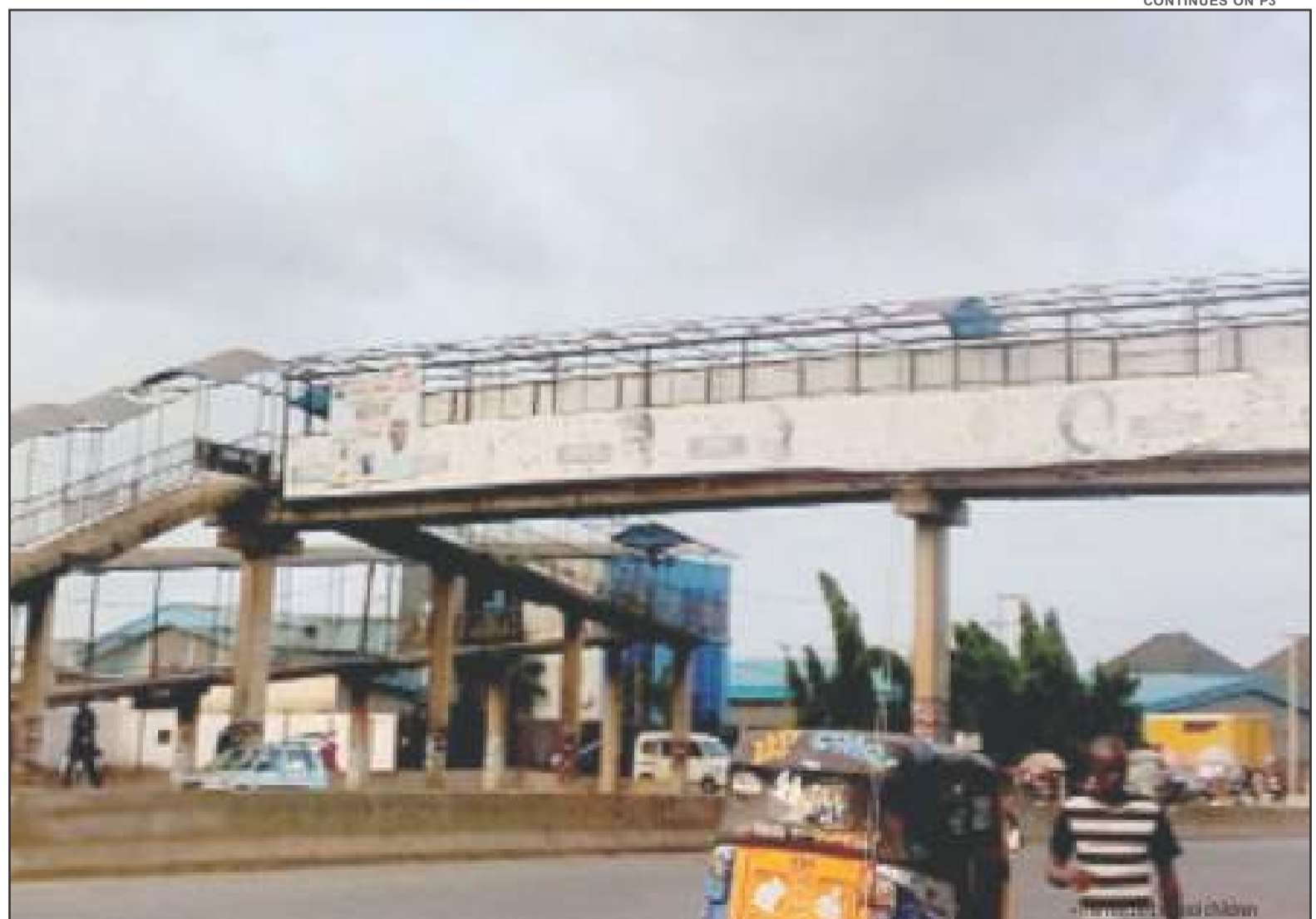
Tincan First Gate Bridge