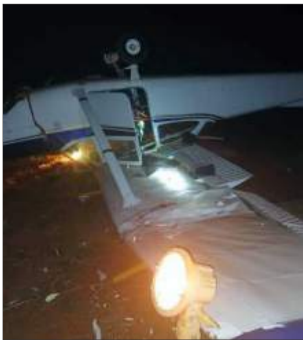
The aircraft that crashed in owerri

A Cessna 172 aircraft with registration number 5N-ASR, operated by Skypower Express, has crashed at the Sam Mbakwe International Cargo Airport, Owerri, Imo State.