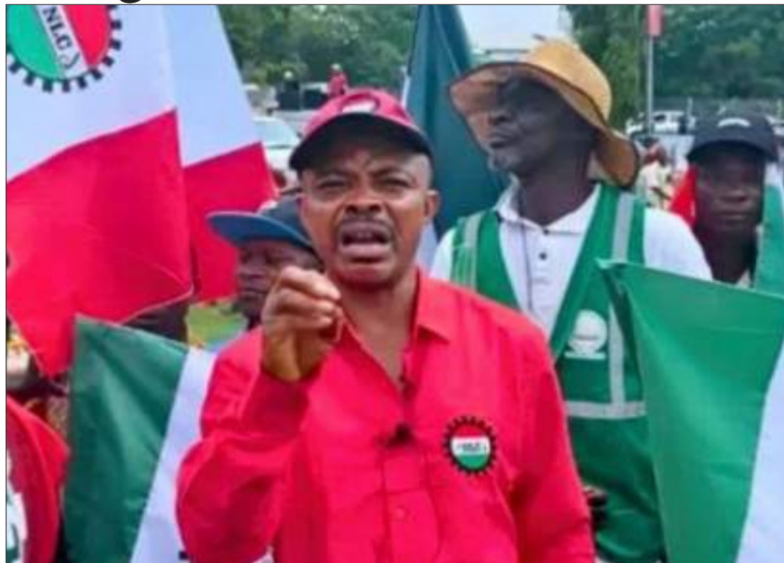
NLC Chairman, Joe Ajaero

situation as deteriorating and warned that continued inaction could deepen public despair.