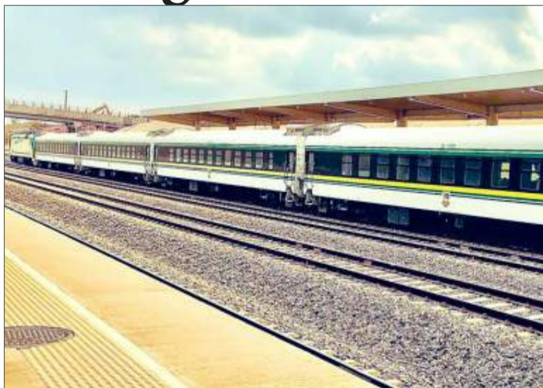
Omi-Adio Train Station

"This repair is necessary to prevent accidents at the spot, we are very