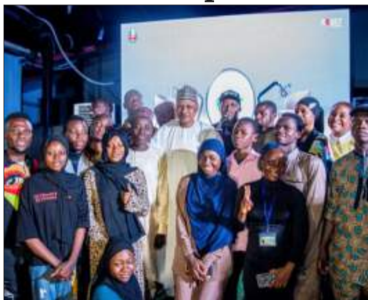
From the Ministry of Information and National Orientation