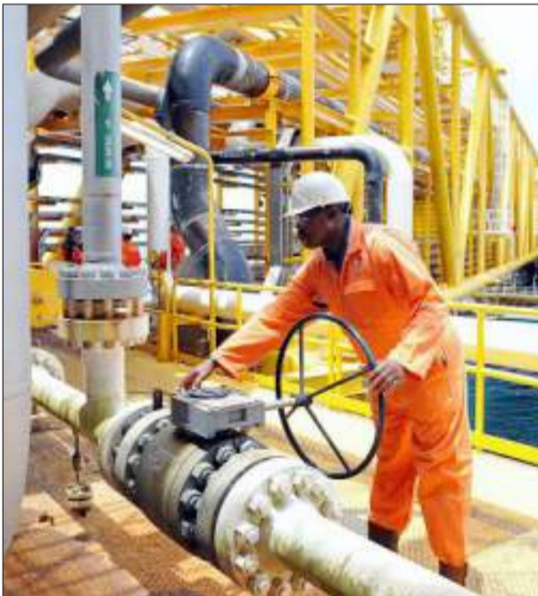
0 J M V S F F O