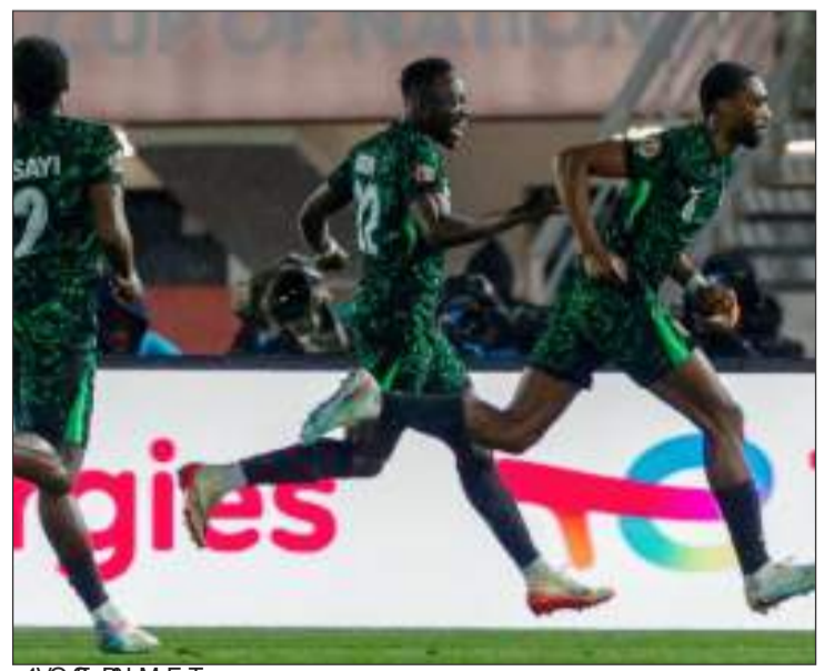
4VQ 5 B M F T

V K R W Z D V V D Y H G E \ W K H 1 J H U D U H V S R Q G H G D O P R W W 7 D Q ] D Q I L R D D O N H H S H U I P P H G D M O Z L W K / R R N P D Q 7 D Q ] D Q I L H V S R Q Z G W O R Q J F R O O H V F K H D O R U W W L K H H X Q Q F H Q V H G Y H Q G R U V D Q G P L V L Q I R U P I O W L L Y R H G 3 R G D P D U D E R O G W H F S U Z D O U R X B R O O H F F L W L V W R P O R G H U C K H D O W G F I D W B B Q V X W I K I H Y H W L J H U K D Q F F H W W D I H D F R U G D E O H D Q G T X D O W D V X U H G P H G F I C H 2 Q R P D W M U Z K H U H W K H O L Y H 3 7 K H ( 3 3 L R X V W U D M W H V $ R C L W S U R Y L G H V D F O I D U H Q I R U F H D E O H H D P H Z R U N I R U W K H U H X O M R Q R I J H O F W R Q F S K D U P D F \ V H U Y L F H V L Q 1 J H U D , W H Q X U H V W K D W I C C R Y D M R Q G R H Q R F R P P I D W W K H I [ S H Q R F H V D I H W \ F W W K K S R O I Z F A D U V H W W I K O I R X Q G D W R Q I R U D Q D W R Q D O O P R R U G L E D S W K I D G H D F F R V \ V L M D W L V W D Q V S D U H Q W V H F X U H D Q G S D W L H Q W F H Q W U H G J O B / M U 8 4 F J O