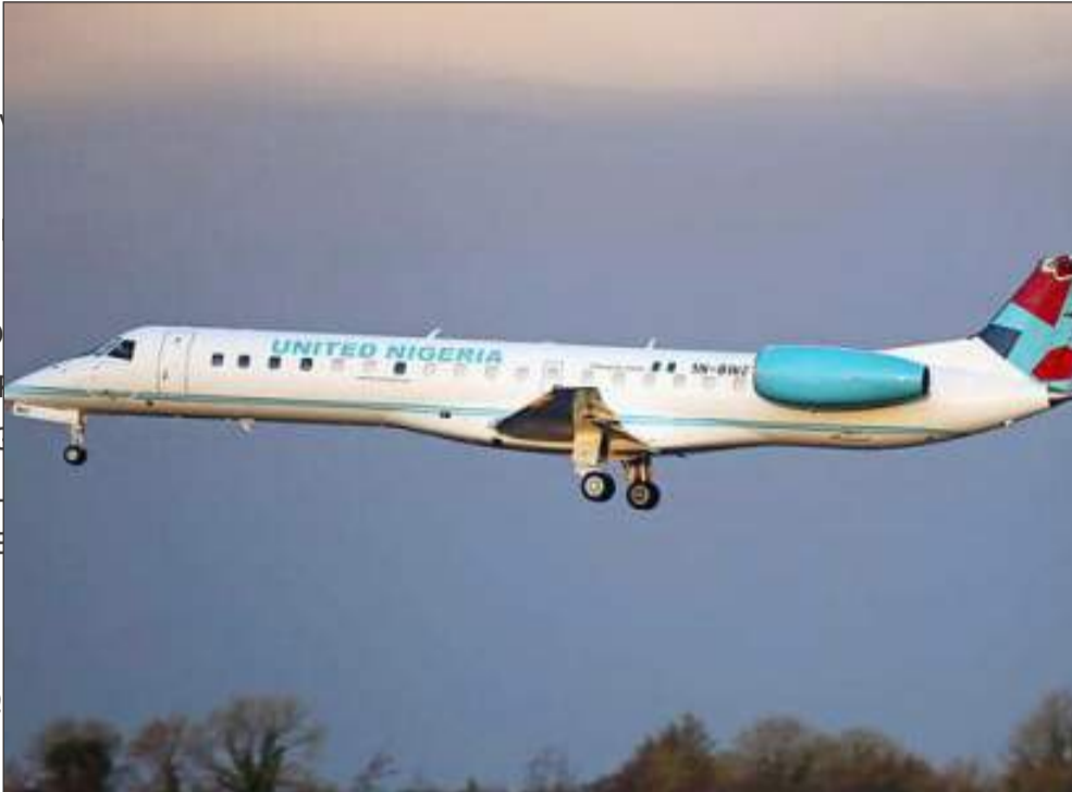
6 O U F E J F S B

8 Q U M G 1 L W H U D $ L U Q H V D Q G 0 D J $ L W U H F R U G K H G J K I S U W S R U R W A L R J Q F D Q F H O Q D W K W R Q X Q U R M H U D F F R U W B O J U B O H E W H K H L J H U & L $ Y D D W X W Q R U L W \\ , Q W V A L J Q W O D D Q E D Q F H O O U H S R K W F R P S D S H G I R U P Z L O M F W K H D P S H U I L R G W K I H & $ V D L C 8 Q L W H J G S I R D W F H Q F H O C D R M H S H F H Q W W Z H H Q Q G H S W H P E D Q P S U R Y H I P R Q V S H F H Q W \ H D U H D U H U 0 D J $ L W I R Q Z H G Z L M D F D Q F H O Q D W H R Q S H B H Q Q V R Z Q I U R P S H F H Q W $ U N $ L W U H G X F H G L W F D Q F H O M R Q U D M V L J Q L ; F A D R Q W S H F H Q W I U R P S H F H Q W K S H U H Y L R D S L U 3 H D E K U R F R W G K I Q U P S S U R Y H P H Q W F X W W D Q F H O O D R A P L R S H F H Q W 4 W R S H F H Q W $ H R & R Q M F R U V P D L Q M Q H G D W M D G F D Q F H O Q D W H R Q S H B H Q Q V R U R V V E R W K U L B I G L Y O H H $ Q U L F R Z H I L M H V U D W H R P S H F H Q W W R S H U