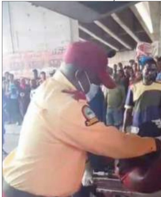
The accident scene