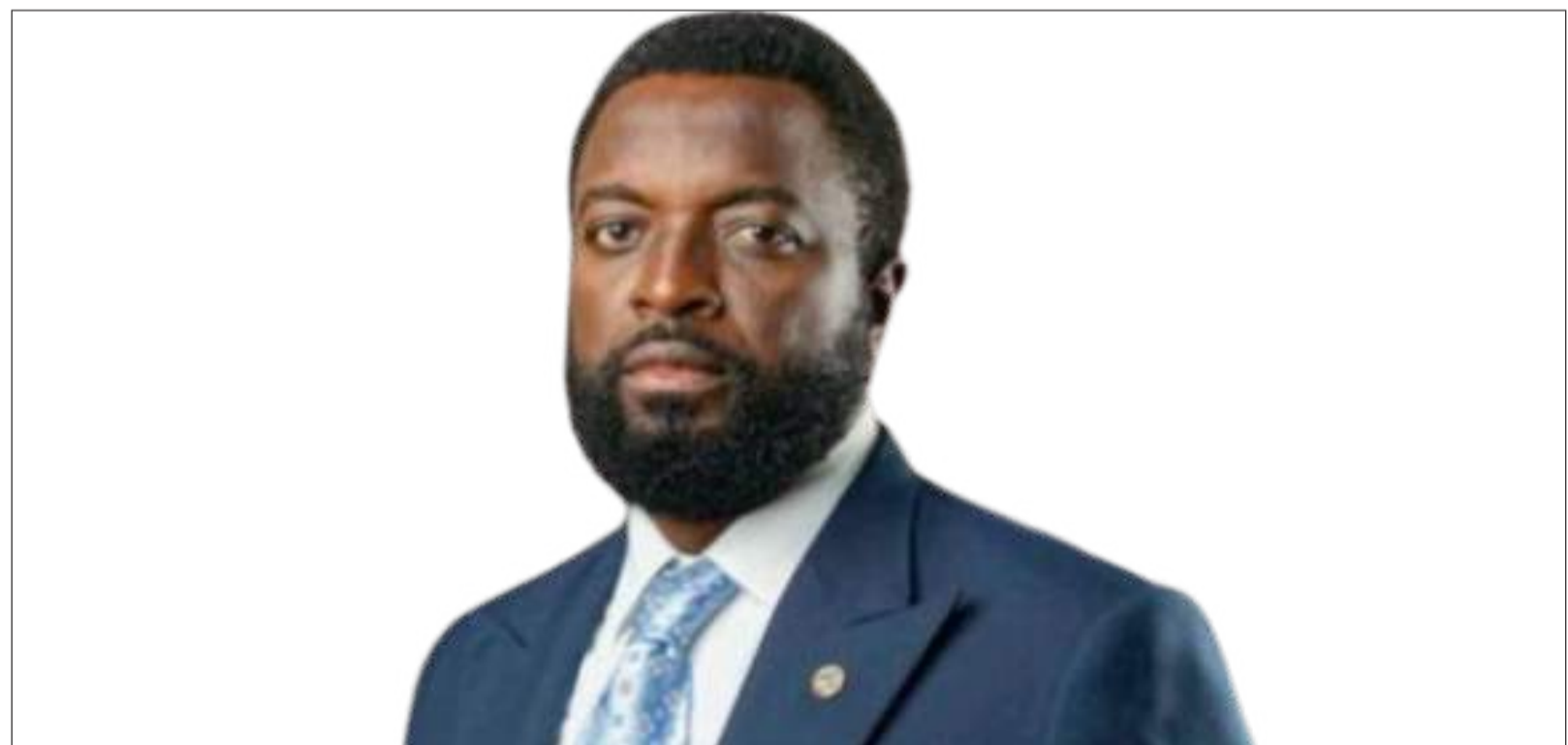
Hon. Oluwaseun Osiyemi

The disclosure followed a joint inspection of the ongoing works by the Commissioner for Transportation, Mr. Oluwaseun Osiyemi, the Special Adviser to the Governor on Infrastructure, Engr. Olufemi Daramola, representatives of the