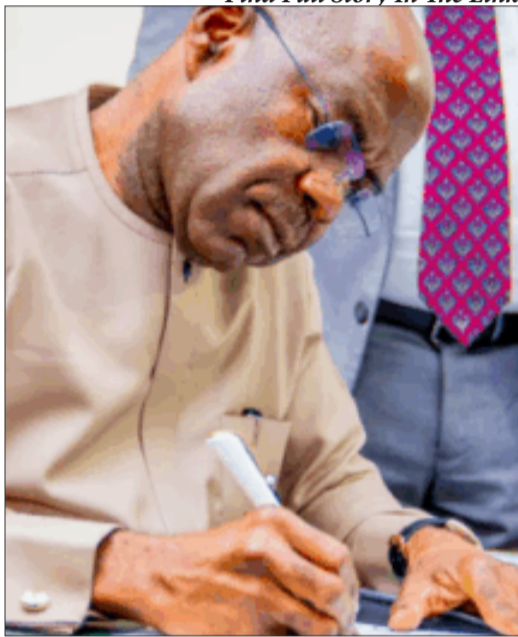
Governor Alex Otti