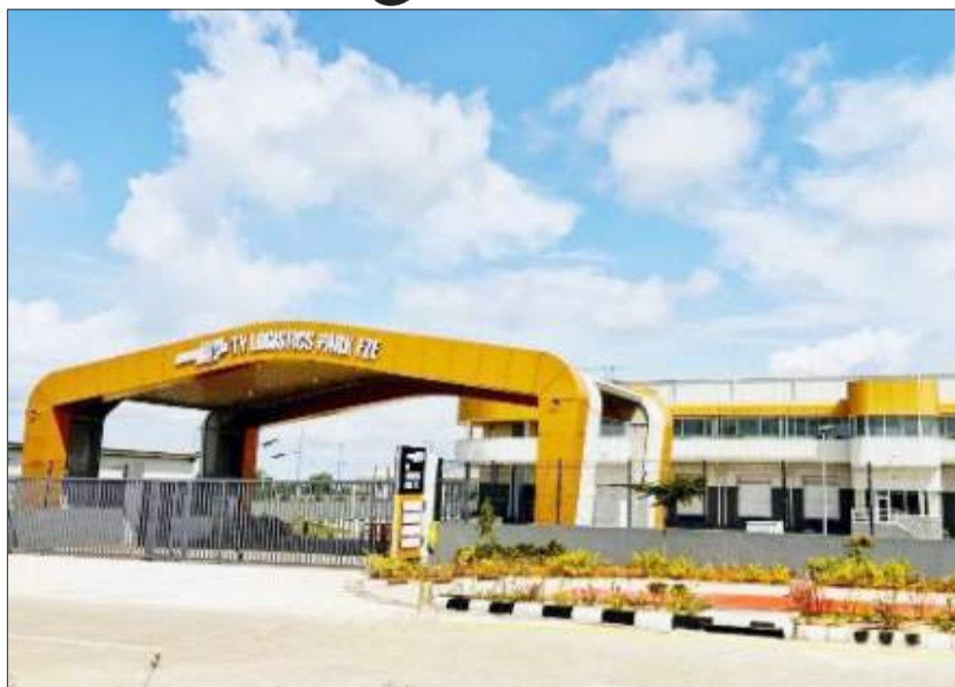
TY Logistics Park

“These are not isolated challenges; they