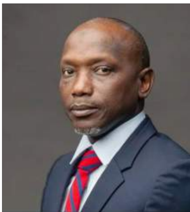
Hon. Sola Giwa

Lagos State Government has confirmed plans to gradually withdraw small commercial buses, commonly known as korope, from major highways as part of a broader strategy to modernise the public transport system and improve commuter safety.