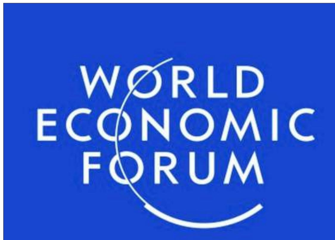
World Economic Summit

Economic Forum reflects our commitment to policy clarity, credible partnerships, and sustainable value creation across priority sectors of the Nigerian economy," Jumoke Oduwole, the minister of Industry, Trade and Investment, said in a statement.