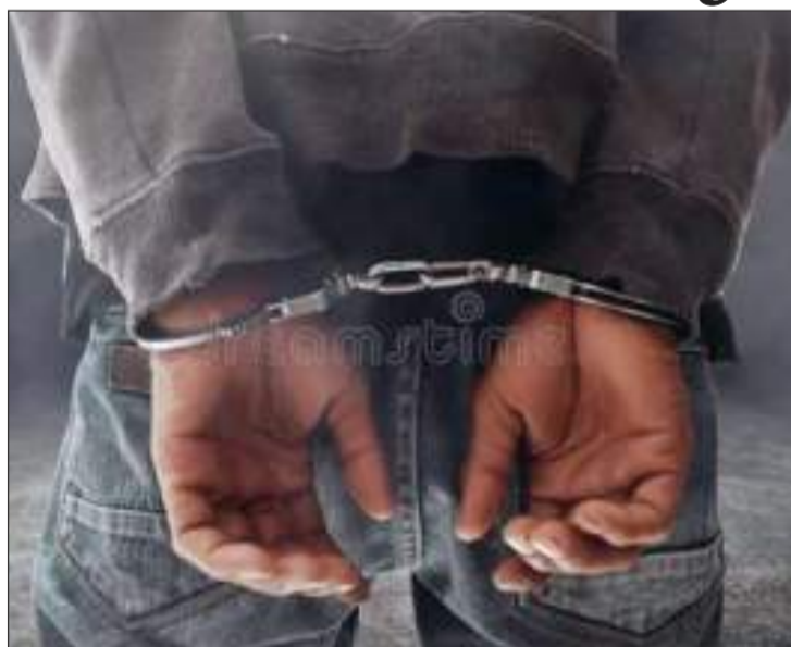
A man with handcuffs

Culled: Ghanaian authorities have detained 141 individuals, largely believed to be Nigerian nationals, in a coordinated operation targeting organised cybercrime networks operating in the country.