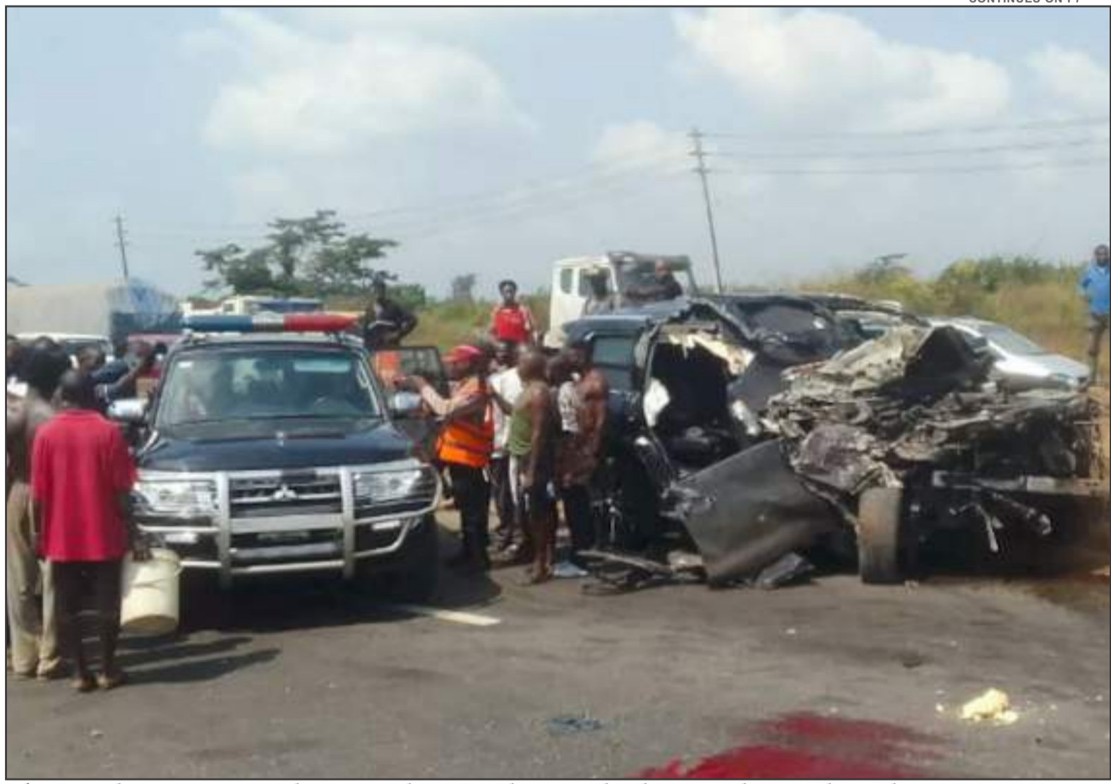
The accident scene involving Anthony Joshua and others in the road crash