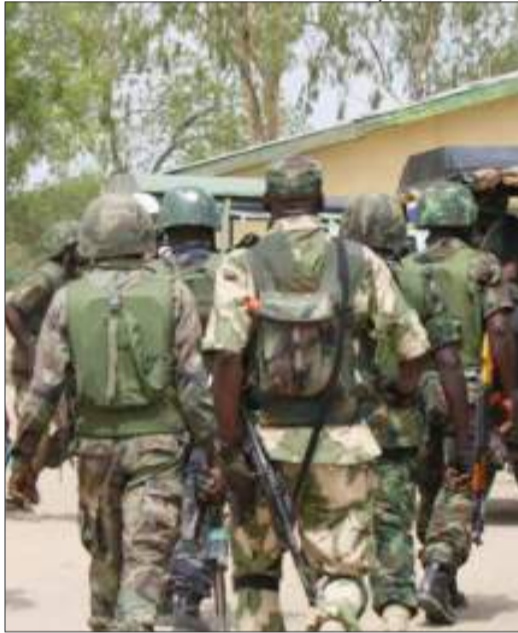
Nigerian army troops