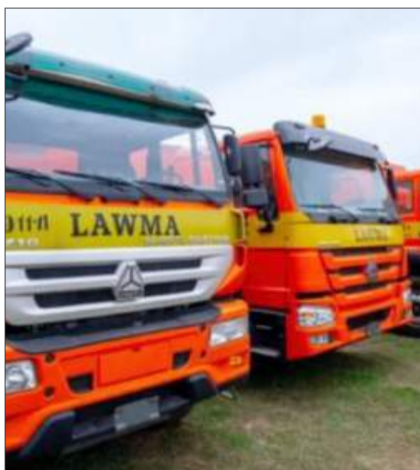
CNG Compactor Trucks

In a state where 13,000 tons of waste is generated every single day, managing such waste poses a huge challenge, and that is the lot of Lagos, Nigeria's commercial nerve centre.