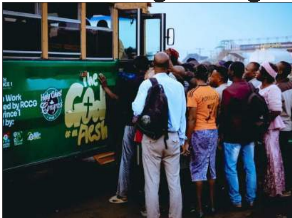
Passengers entering the RCCG free bus to work

The programme operated about 10 long yellow buses conveying hundreds of passengers each day. Morning routes included RCCG Jesus's Palace (Festac) to CMS; Oworonshoki to CMS; Redemption City to 7UP; Redemption City to Sagamu; Redemption City to Trinity Towers, Victoria Island; Redemption City to Agege; and Ikorodu to Maryland. Free return trips were also provided in the evenings.