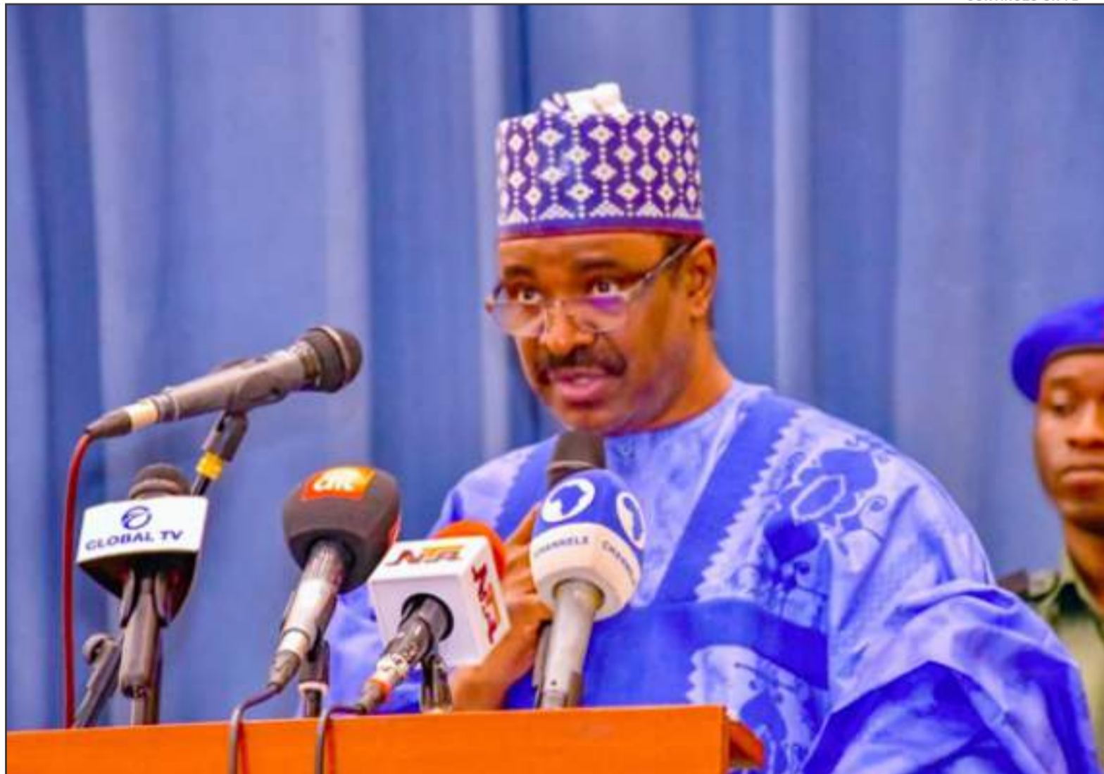
Federal Minister of Transportation, Said Alkali