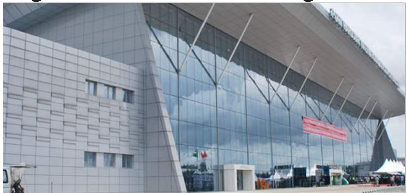
Port Harcourt airport

give private investors long-term leases of 15 to 30 years to develop airports into “aerotropolises” that can generate profit for both operators and the federal government.