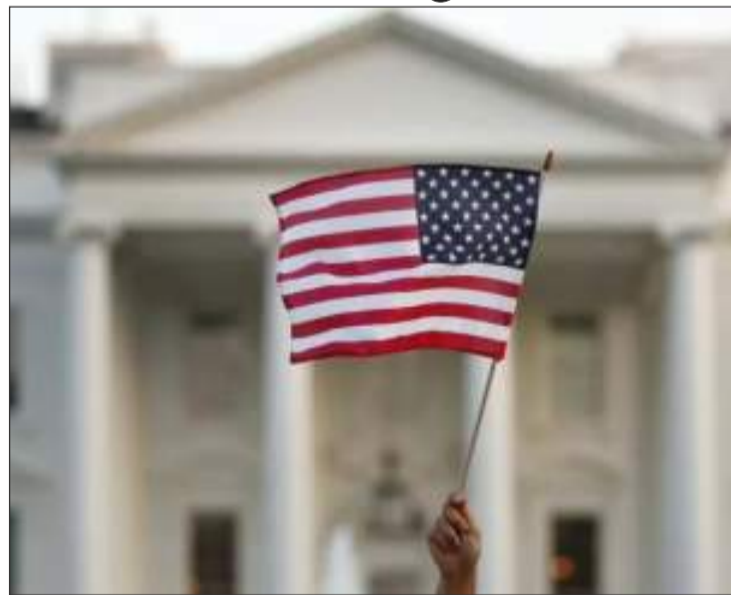
US Mission Nigeria

Culled: The US Mission Nigeria has announced the launch of the "Made in America, Loved in Nigeria" Social Media Skit Contest, a nationwide digital competition aimed at showcasing how American products,