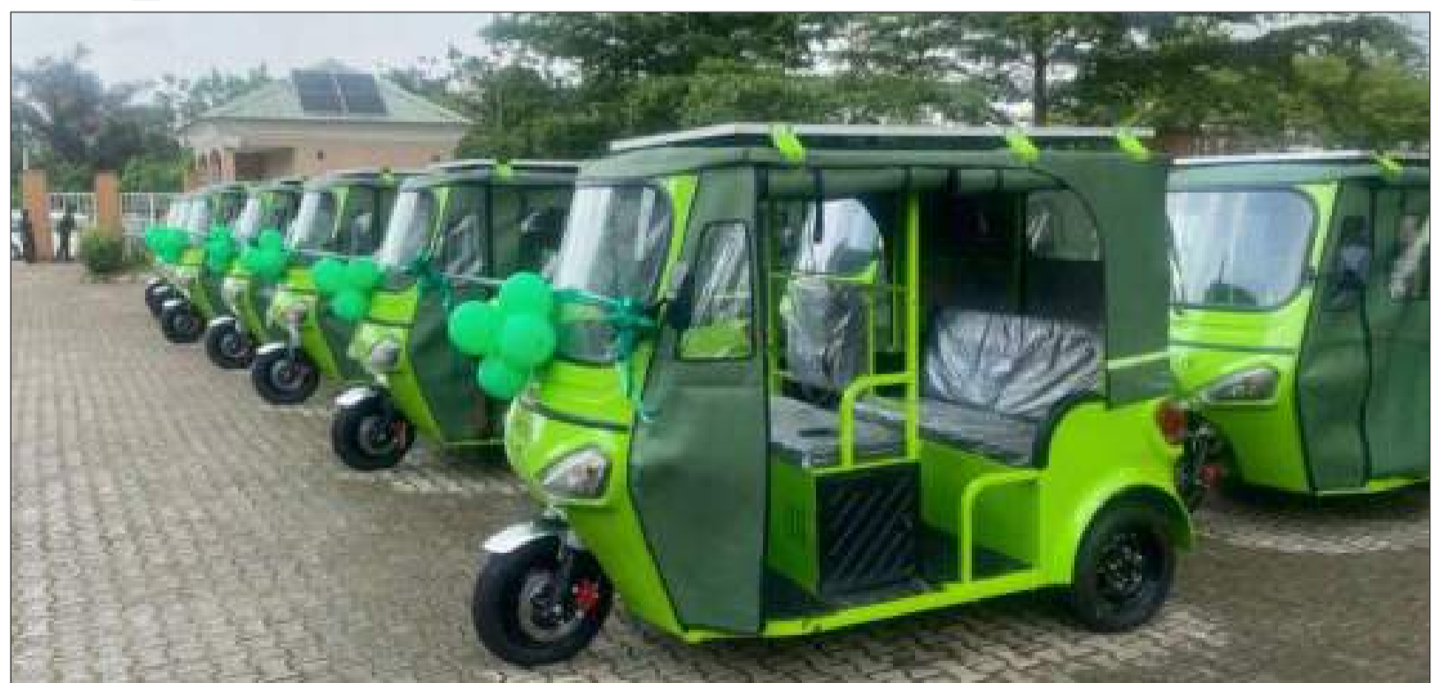
Solar-powered electric tricycles

solutions that are innovative, sustainable and directly responsive to the needs of our young people. Today's programme is the result of that directive," he said.