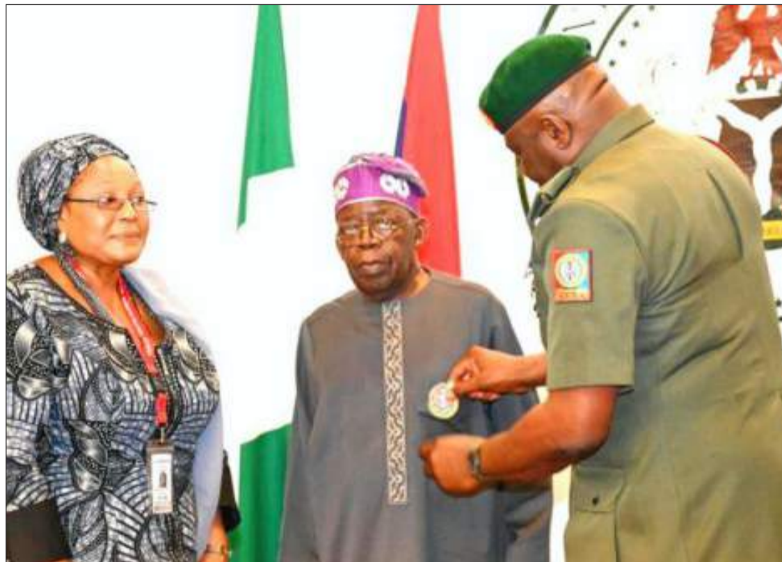
President Tinubu with the remembrance emblem

"As a grateful nation, we must honour the fallen, support the wounded, and create and care for all who answer the call to serve the Armed Forces. Remember Remembrance Day, marked every 15 January, is a reminder of the cost of peace and the importance of unity