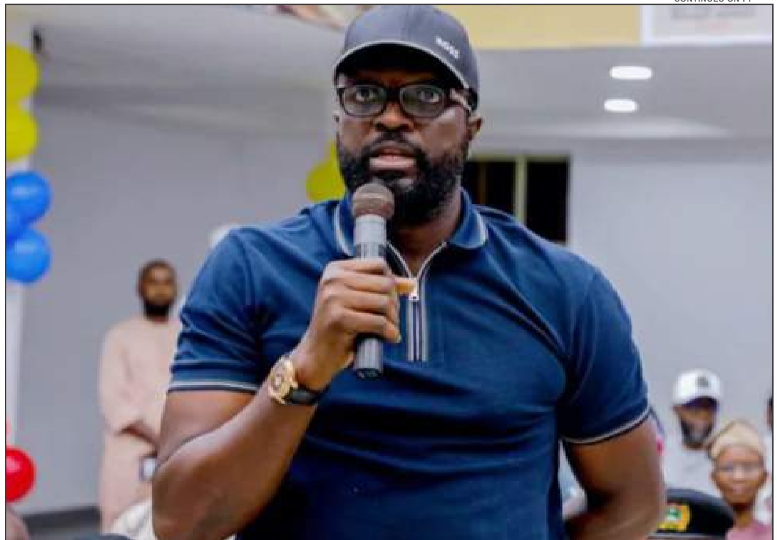
Honourable Commissioner for Transportation, Hon. Oluwaseun Osiyemi