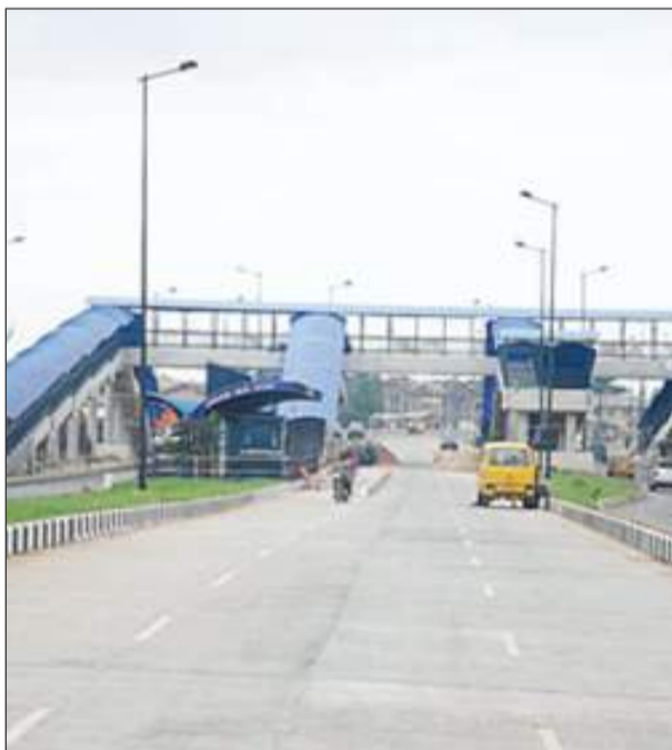
BRT Bus space

When the Lagos State government promised to bring more BRT buses to Ikorodu Road, residents were hopeful. The announcement came with assurances of shorter waiting hours, smoother boarding and a better commuting experience.