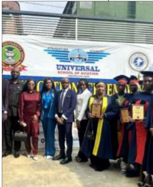
Universal school of Aviation