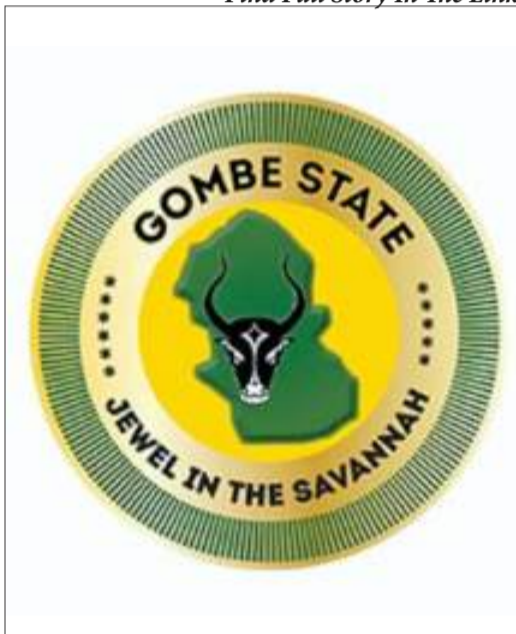
Gombe State Govt