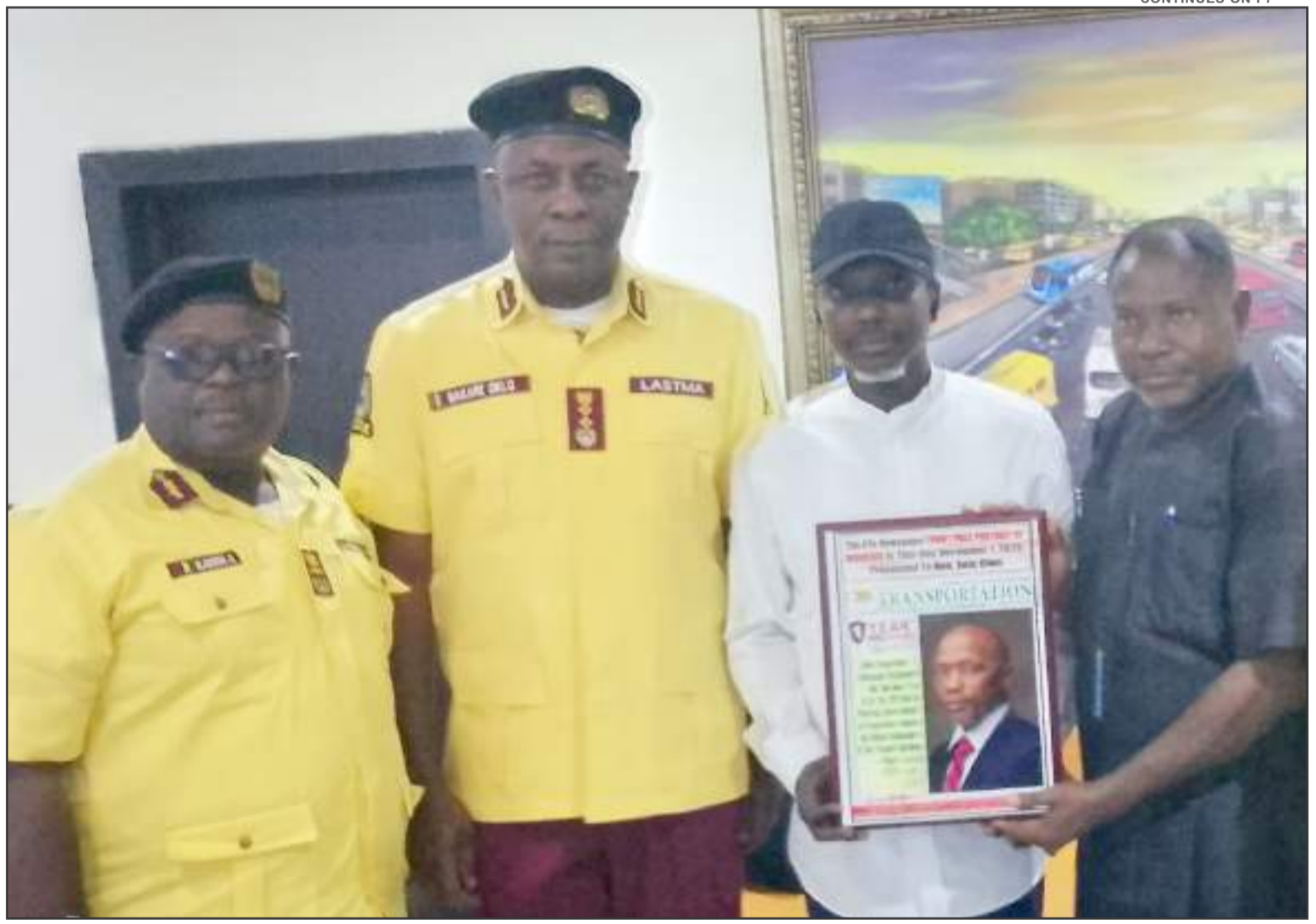
Hon. Sola Giwa receiving our 'Front Page Portrait of Honour' Plaque as the Best Performing Special Adviser on Transportation