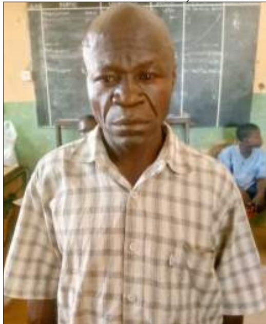
The fake FRSC officer