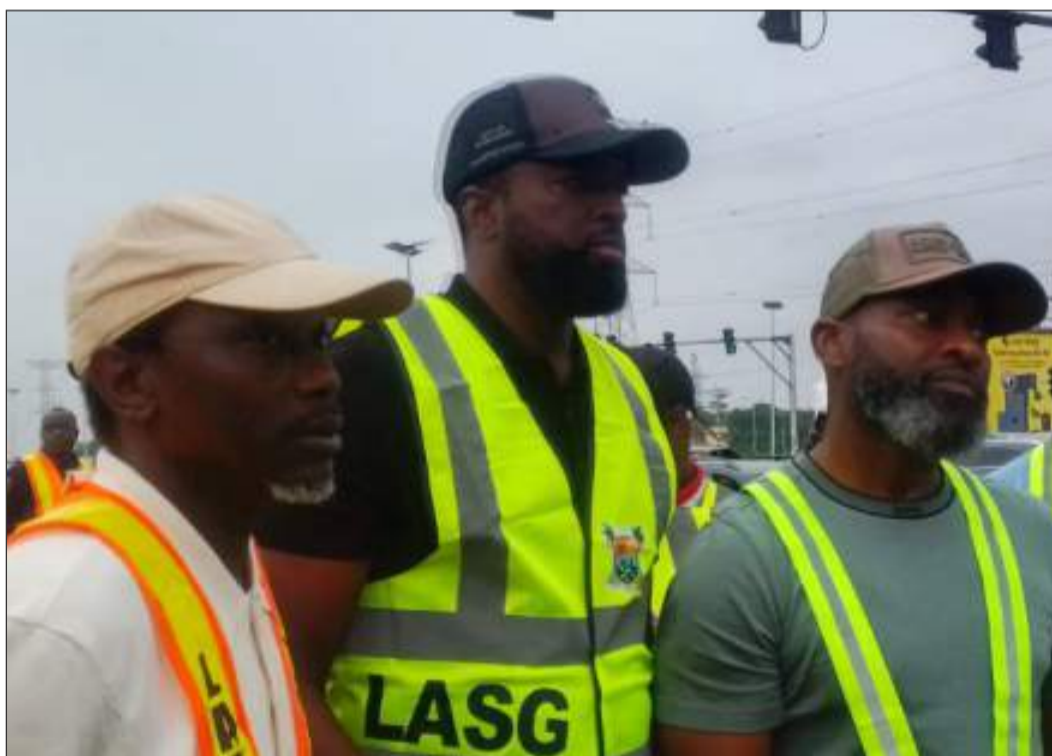
Osiyemi inspecting the Lekki-Epe expressway

Speaking during the tour, Engr. Daramola explained that the project, awarded by Governor Babajide Sanwo-Olu, involves the rehabilitation of both carriage-ways of the Lekki-Epe