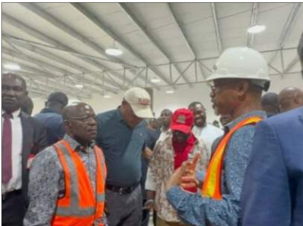
Gov Otti inspecting the ongoing construction of the Umuahia central bus terminal

"So we thought we should concentrate all those transport terminals in this place, instead of having different