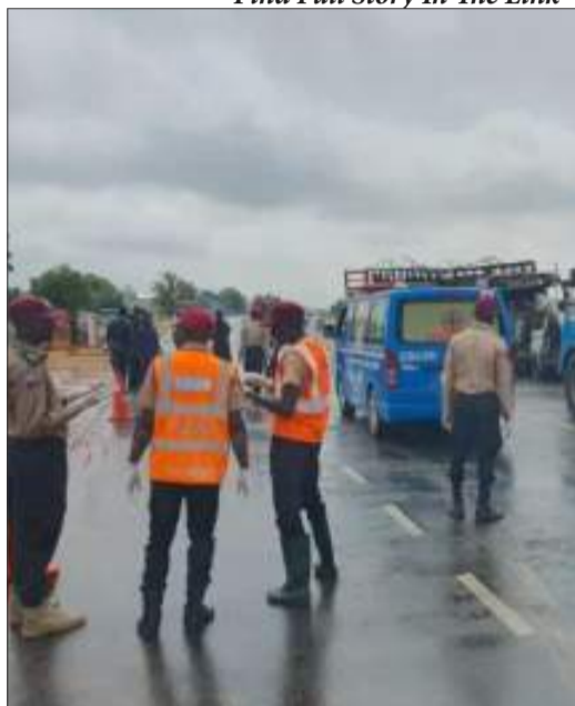
FRSC rescue team