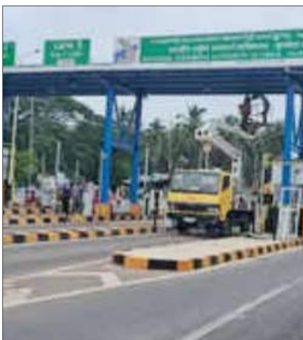
The deplorable road

Residents of Puposhola in the New Oko-Oba area of Lagos State have appealed to the state government to fix the dilapidated road in their community.