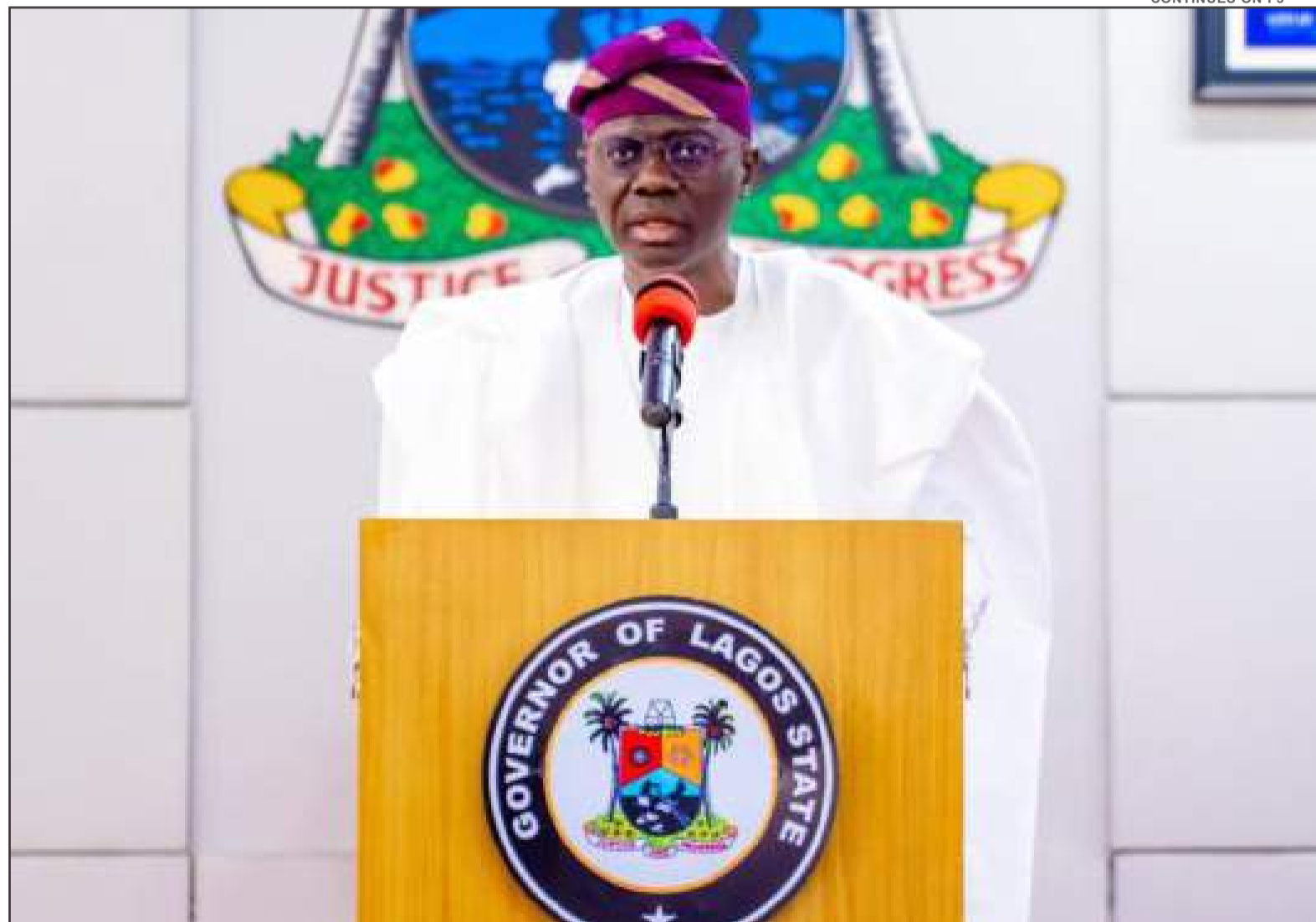
Mr Babajide Sanwo-Olu - Lagos State Governor