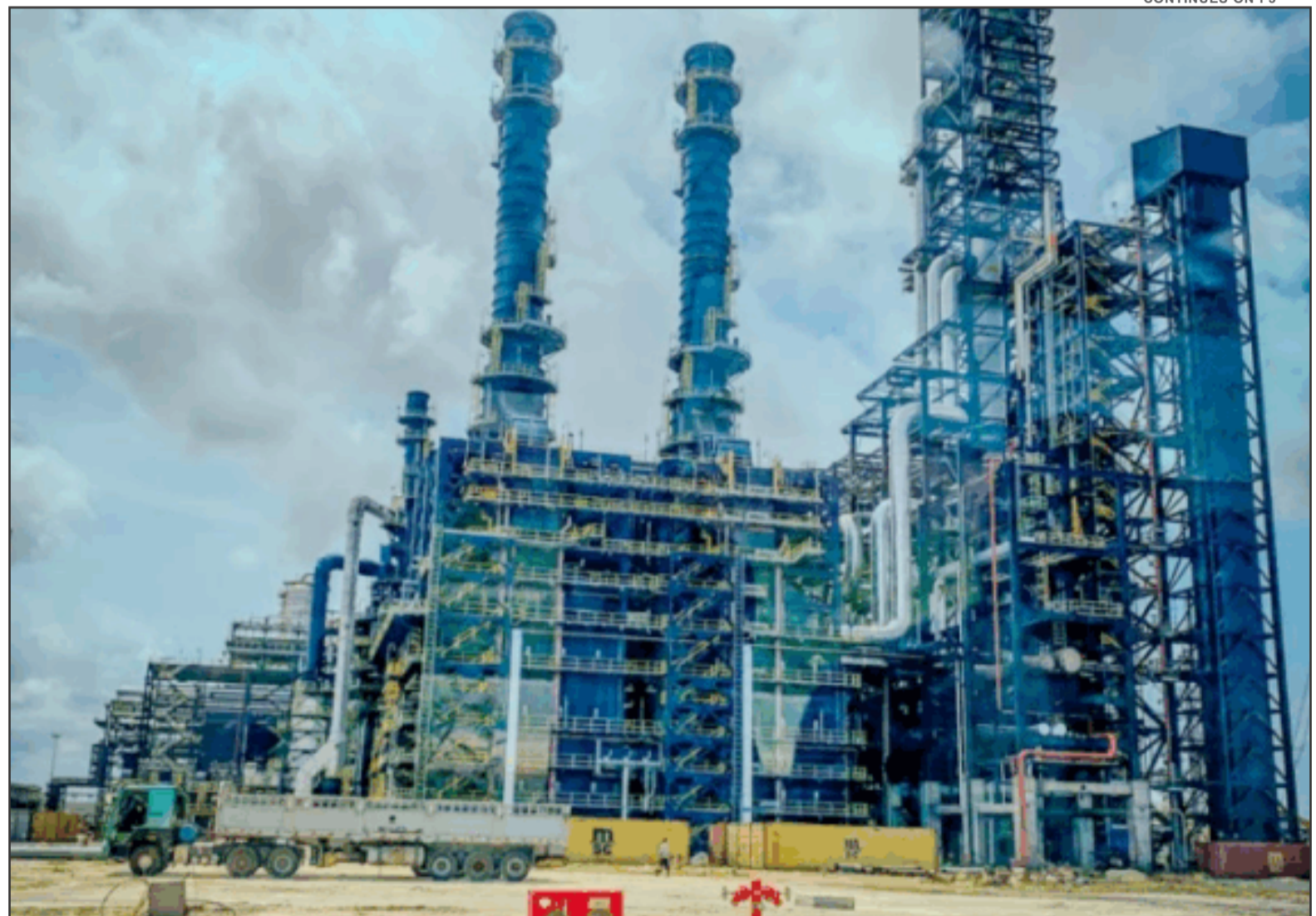
The Dangote Refinery