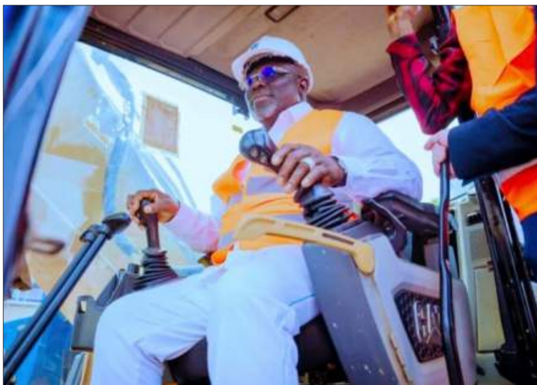
Governor Oborewori inspecting the roads

According to him, the dangerous intersection of vehicles, motorcycles, and pedestrians on the federal highway, coupled with poor traffic management, made a lasting solution inevitable.