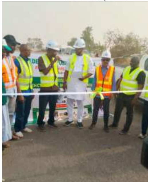
The kaduna state government inaugurating the roads