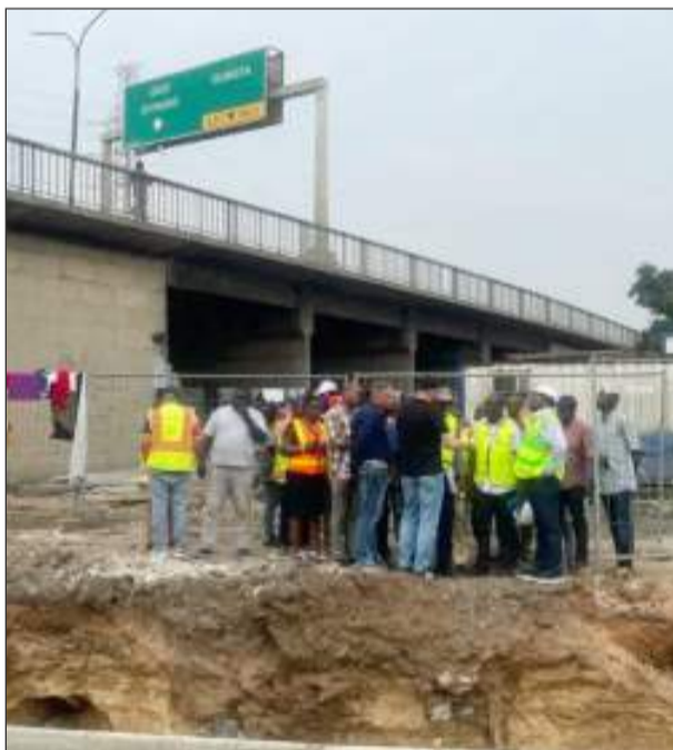
The Iddo bridge in Lagos

Half of the Iddo Bridge in Lagos State will be demolished next week in preparation for rebuilding.