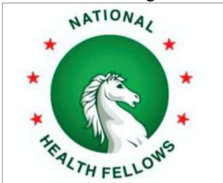
National Health Fellows (NHF)