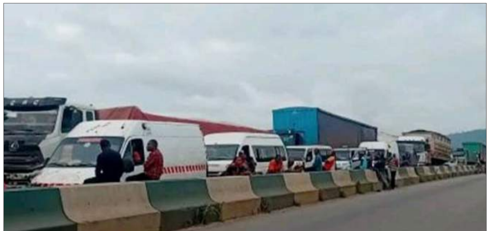
The traffic gridlock on Abuja-Lokoja road