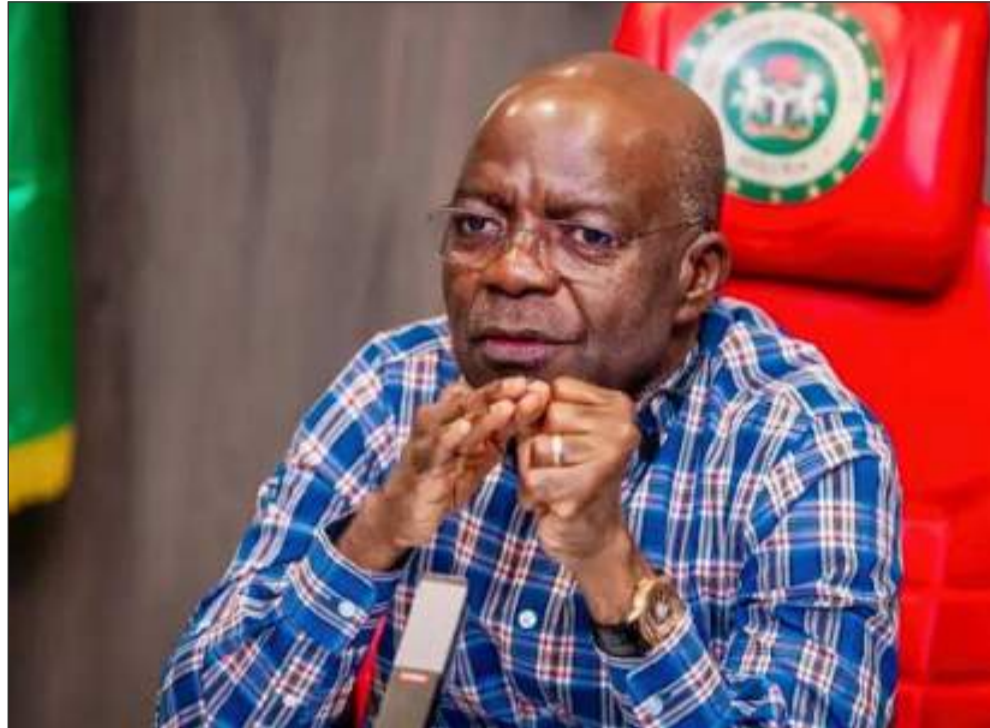
Governor Alex Otti

all those transport terminals in this place instead of having different terminals at different places in the town," Otti stated. The governor, who appreciated the quality and level of progress of