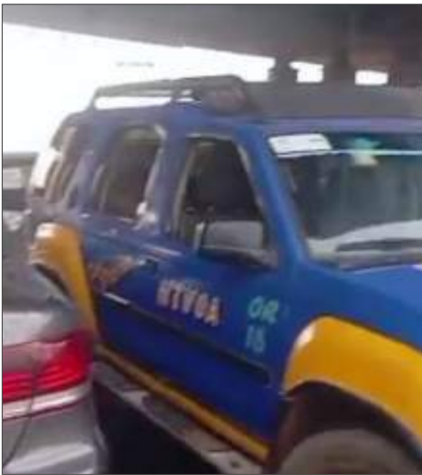
The third mainland bridge incident

The Lagos State Traffic Management Authority (LASTMA) and officers of the Nigeria Police Force have evacuated two vehicles involved in a collision at the Third Mainland Bridge at Adeniji Intersection area of Lagos State.