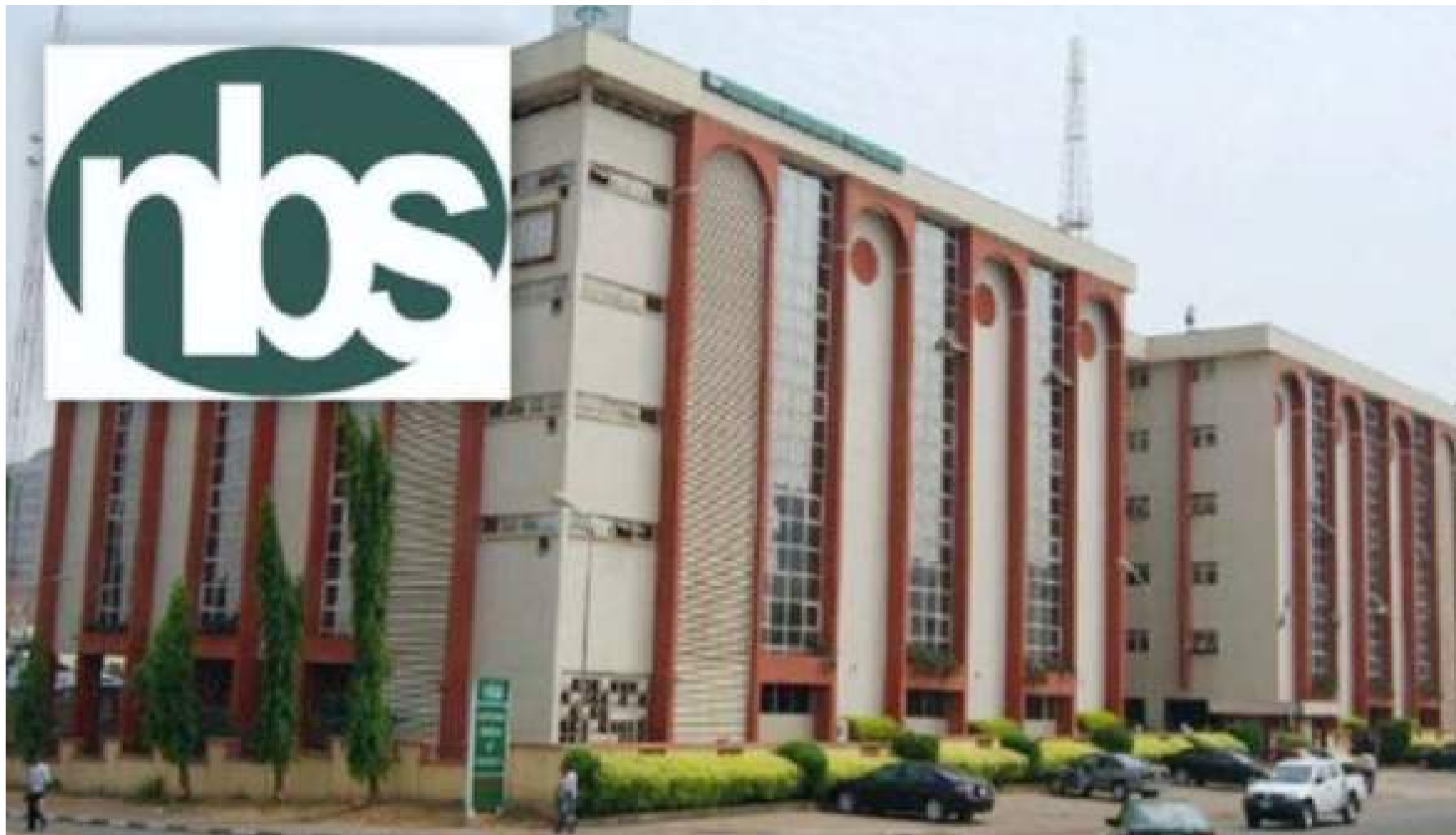
National Bureau of Statistics (NBS)