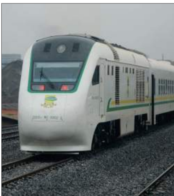
National Railway Corporation (NRC)

The Nigerian Railway Corporation (NRC) has announced a temporary adjustment to its Abuja-Kaduna train service schedule ahead of the Federal Capital Territory (FCT) Council Elections.