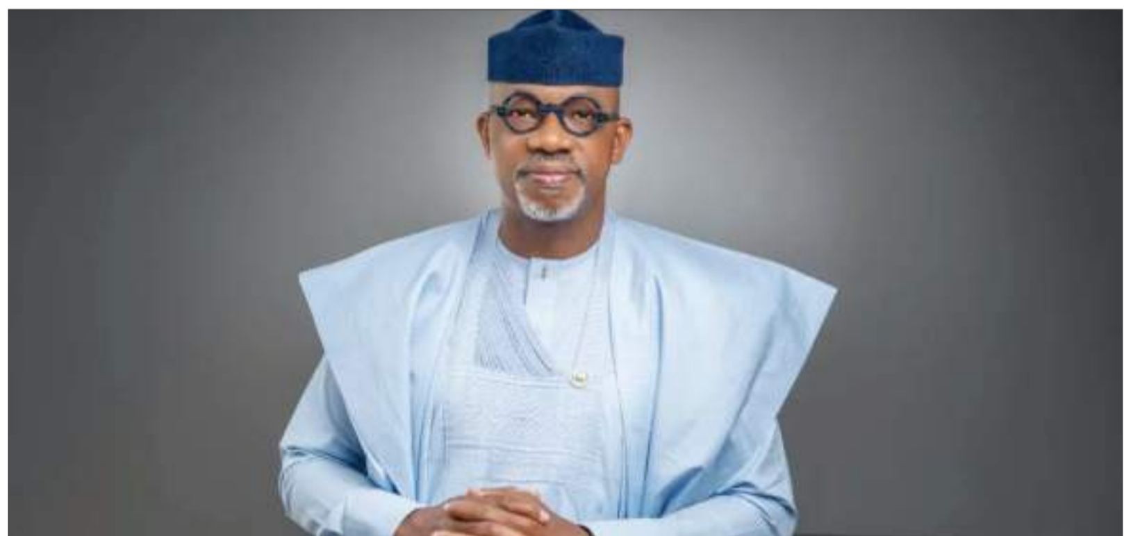
Governor Dapo Abiodun.

Abiodun explained that the roads executed in the district were selected