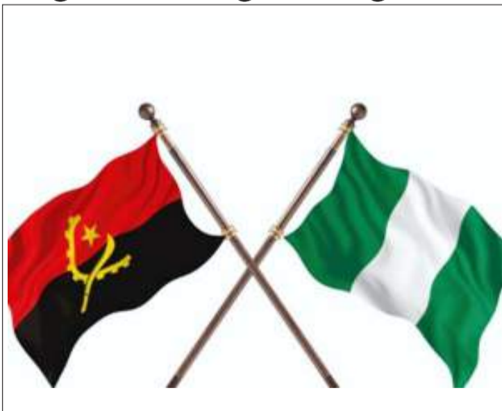
Nigeria signs an agreement with Angola