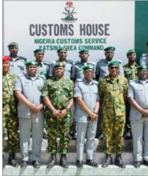
Nigerian Customs and Navy