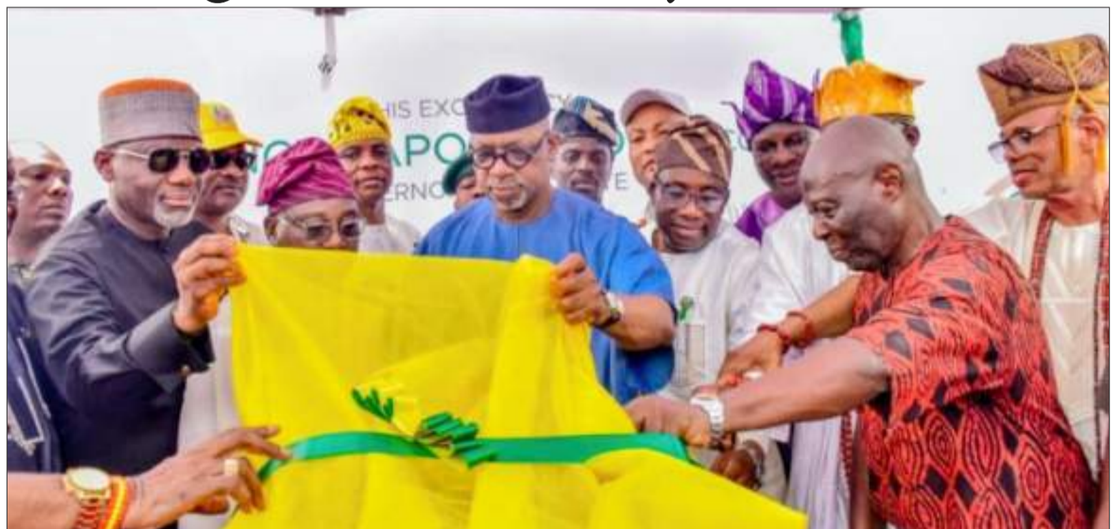
Governor Abiodun inaugurates the Iworo-Ogbogbo-Igbeba road

Abiodun said his administration is deliberate about infrastructure renewal