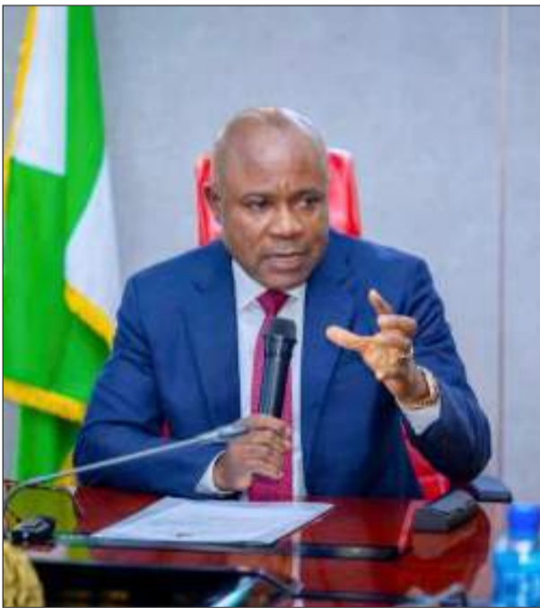
Governor Peter Mbah

The Enugu State Governor Peter Ndubuisi Mbah hosted the Governing Council and management of Federal Polytechnic, Ohodo, Igbo-Etiti Local Council recently, pledging his government's support for the infrastructural development of the institution. He promised to construct the seven kilometer road leading to the polytechnic from the Otukpo-Obollo-Afor-9th Mile-Enugu Road, assuring that his administration would support the institution to become a citadel of excellence in technological, engineering and skills training.