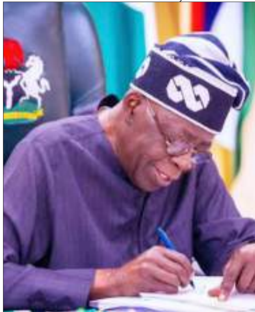
President Bola Tinubu