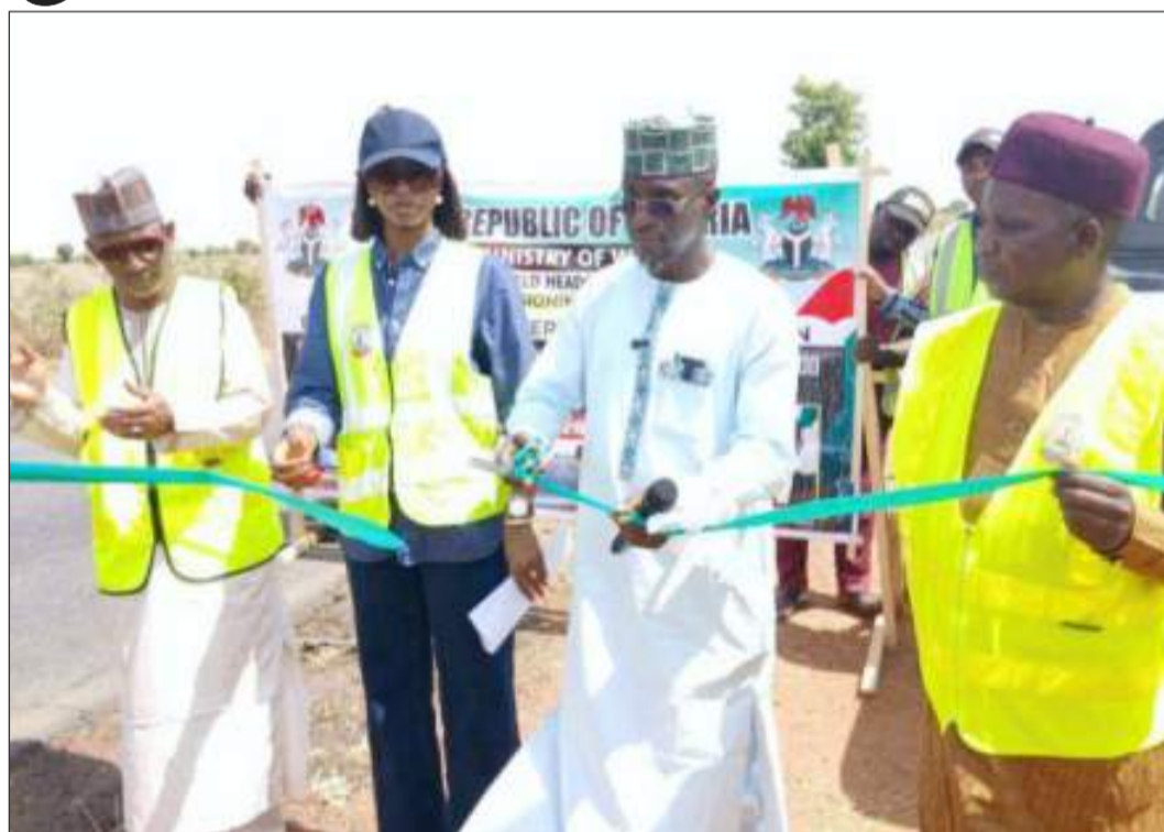
Gombe State Government

He explained that infrastructure and transportation remained key pillars of the administration of President Bola Ahmed Tinubu, under the Renewed Hope Agenda.