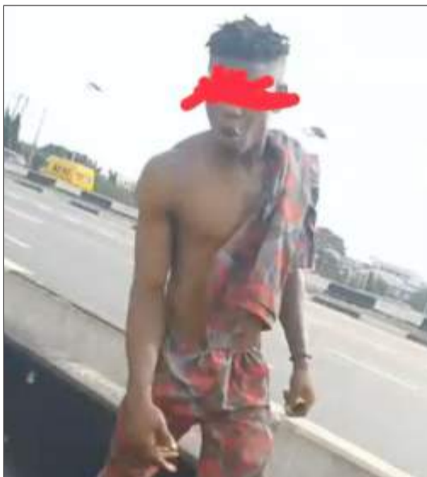
The driver who stabbed an officer

The Lagos State Traffic Management Authority has condemned an attack on one of its officers who was allegedly stabbed by a commercial bus driver at Ojota Interchange, Lagos.