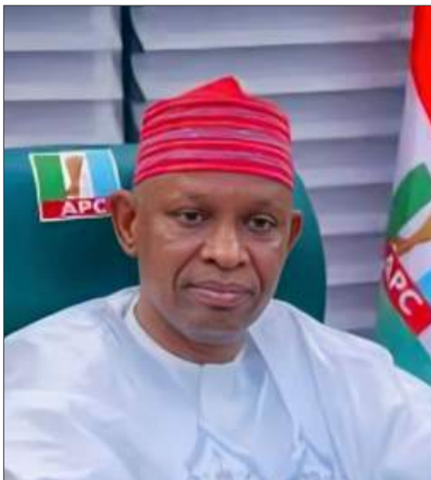
Governor Abba Yusuf

THE Kano state government has inaugurated the newly constructed TRC Bridge at the Challawa 6MW Hydro Power Site, linking Turawa town and surrounding communities in what officials described as a major boost to transportation and socio-economic activities in the area.