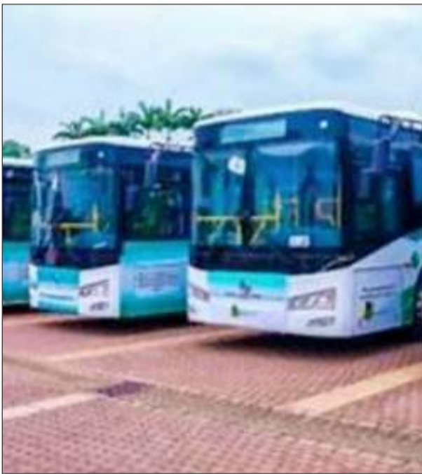
Compressed Natural Gas (CNG) Buses

Many residents of the Federal Capital Territory (FCT) have called on the Federal Government to provide more Compressed Natural Gas (CNG) buses to ameliorate transportation challenges in the territory.