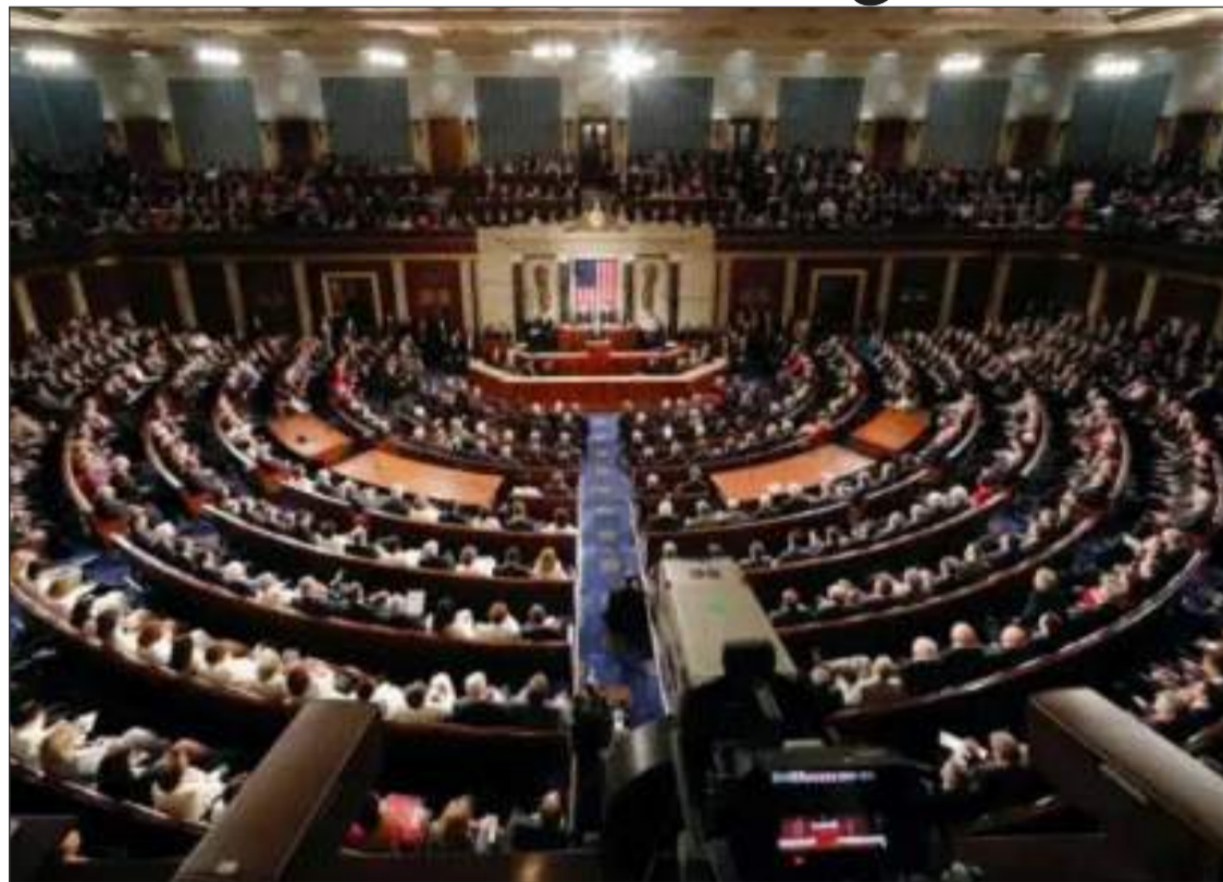
The US Congress

The recommendations put forward by the Congress, in conjunction with House Foreign Affairs Committee and House Appropriations Committee, followed months of